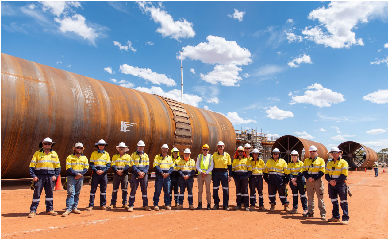
Image – Lynas Rotating Kiln (Kalgoorlie construction team & Kalgoorlie-Boulder Mayor; John Bowler). Kiln sections ready for installation

It is expected that on the growth trajectory Alltype is in a position to now increase Net Operating Profit commensurate with the Pre-Investment into Overhead to deliver sustainable earnings and a greater Operating Profit.