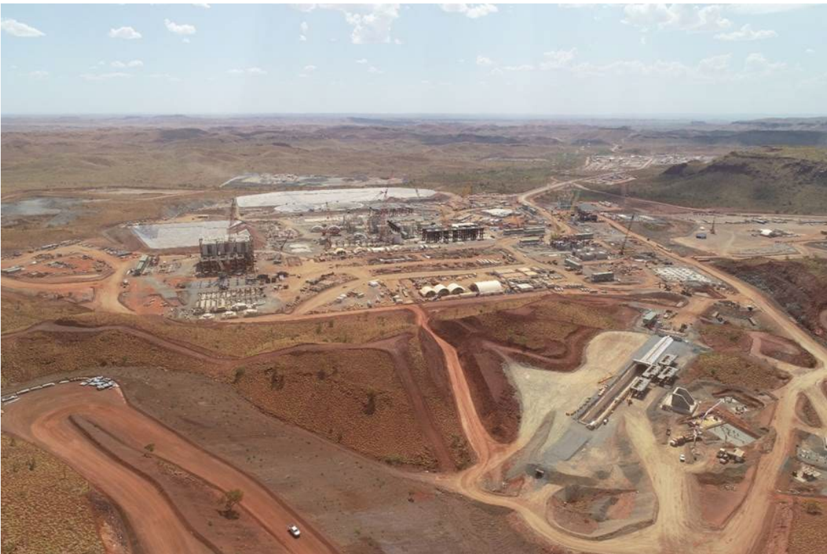
Image – Iron Bridge Wet processing facility progress update

SIMPEC is progressing well with the major construction activities on the Iron Bridge Magnetite Project for the Wet Processing Plant. The Project is a joint venture between Fortescue Metals Group subsidiary FMG Magnetite Pty Ltd and Formosa Steel IB Pty Ltd.