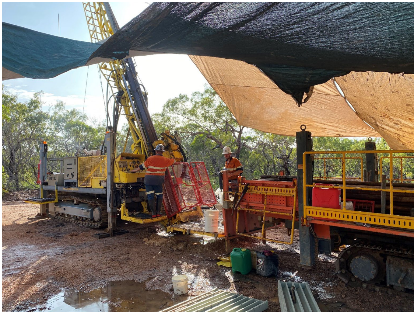
Image 1. Drilling commenced at Jedha 1 anomaly.

Approved by the Board of Alice Queen Limited.