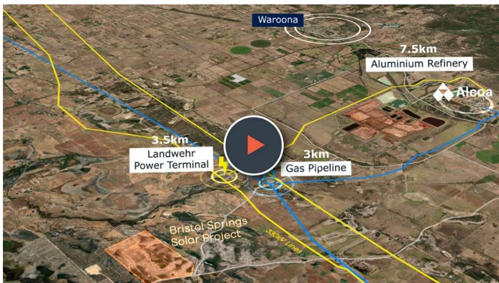
Figure 1: Click on the image to view a Virtual site trip to the Bristol Springs Solar Project (or visit the Company's website- www.frontierhe.com/videos/ )