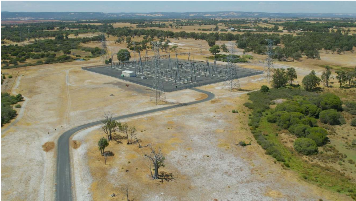
Figure 4: Landwehr Terminal – 33/330kV transformer