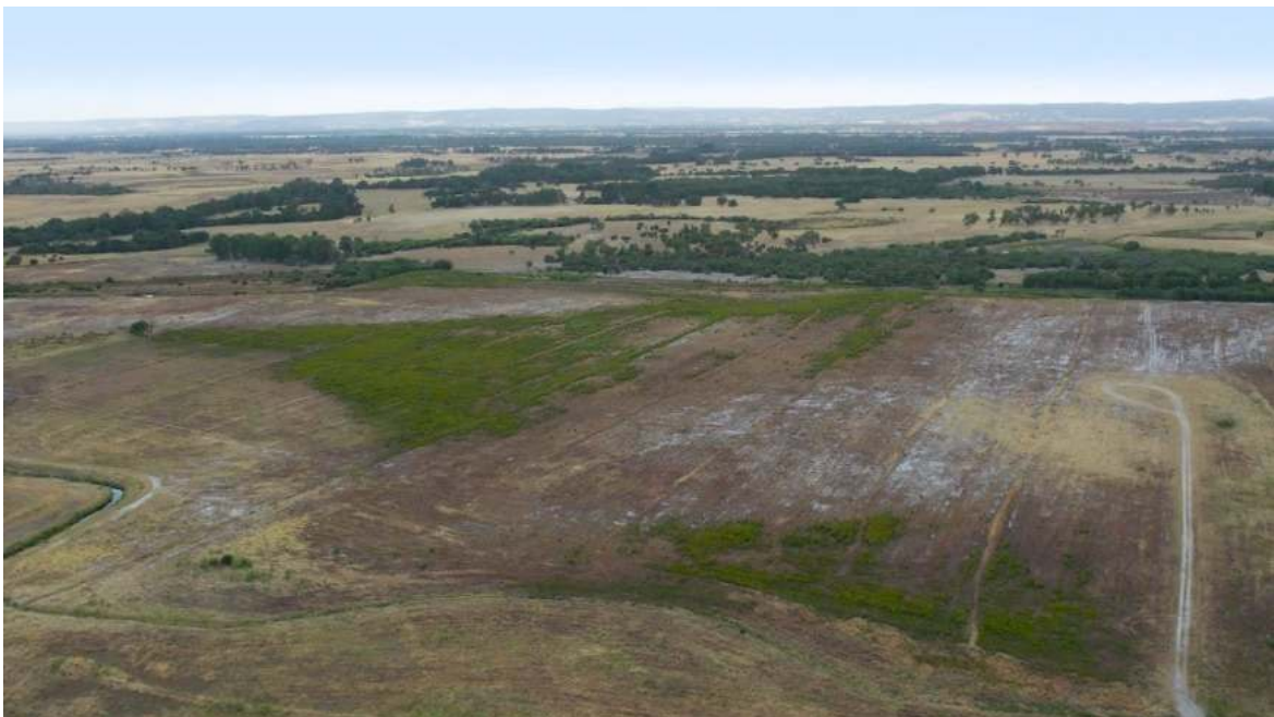
Figure 3: Aerial view of the Bristol Springs Solar site