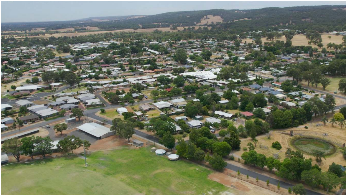
Figure 5: Waroona town – 8k from the BSS Project