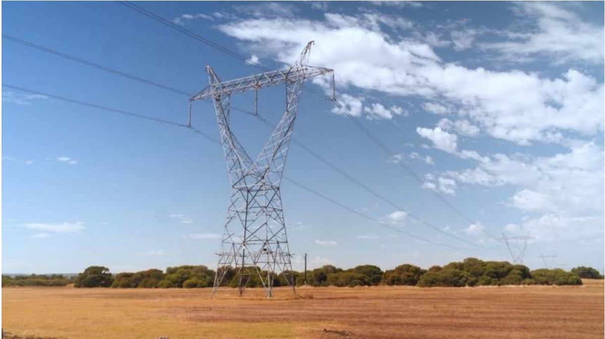
Figure 2: 330Kv Lines within 3km from BSS

The ETAC will provide the Company with access to the SWIS. Additional land acquisition opportunities are available that could allow an increase in solar power generation of up to ~490MWdc.