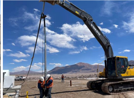
Figures 3-4. Rincon Lithium Project – 2,000tpa Operation Brine Systems Site Works