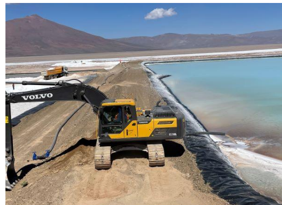
Figures 7-8. Rincon Lithium Project – 2,000tpa Operation Brine Systems Site Works