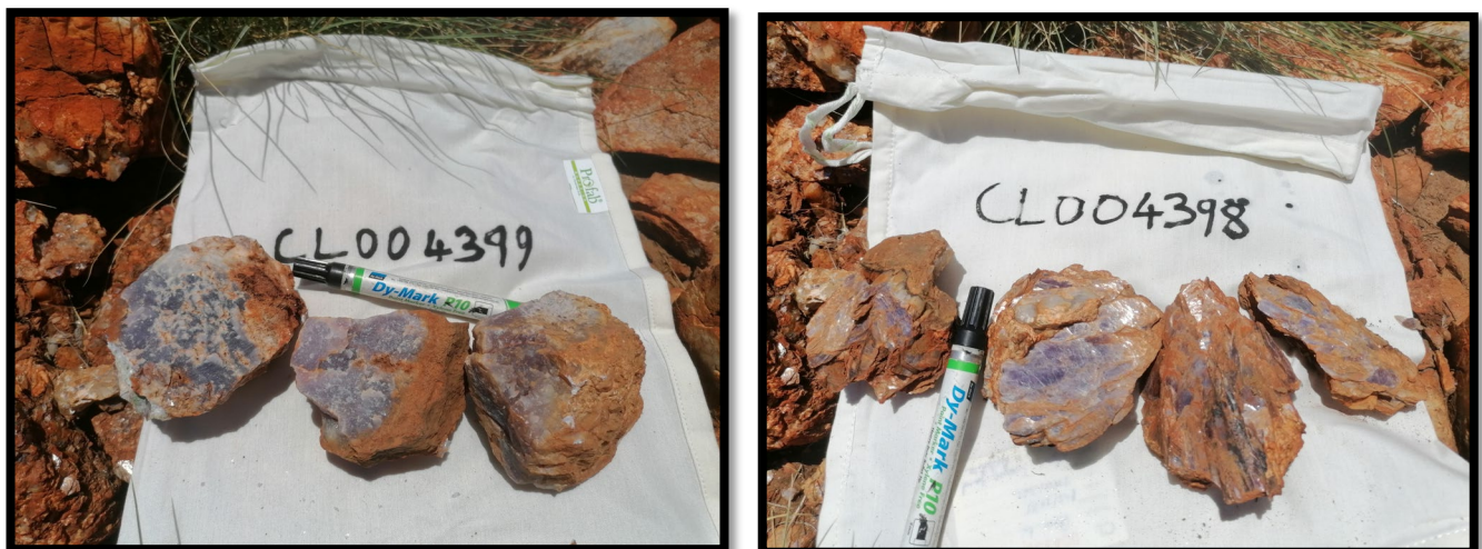
Figure 4 – Samples of coarse spodumene (LHS) and coarse lepidolite (RHS) from samples sent for assay.

Thirty-four rock chip samples were collected from the pegmatite, metasomatized country rock adjacent to the pegmatite, and background country rock. Samples were collected from five traverses perpendicular to the strike of the pegmatite. Along each traverse, samples were collected 3-12m apart to ensure that all the main components of the pegmatite, including lepidolite- and spodumene-poor zones, were sampled. At each site, the pegmatite was sampled according to the mineralogical proportions of both lithium minerals and barren minerals (feldspar and quartz) present in the outcrop. Samples ranged from fine grained to coarse grained, with the majority medium to coarse grained.