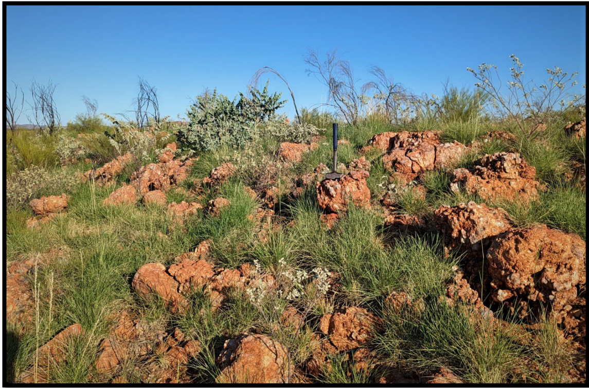
Figure 3 – Outcrop of the pegmatite