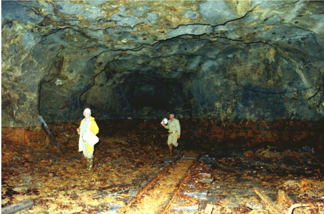
Figure 3: Picture taken in the 1990's underground at Carr Boyd showing extensive remobilised breccia mineralisation.

Estrella has partnered with the CSIRO to determine if the Carr Boyd mineralisation was derived from remobilising sulphides from a pool of sulphides located on the T5 basal contact. If proven, the mineralisation represents a bleed-zone from something much larger at depth and would confirm the Company's model regarding the potential for the Carr Boyd Layered Igneous Complex to host large-scale nickel-rich sulphide trap sites. Geological work by Estrella and the CSIRO, assisted by drilling, downhole electromagnetics and seismic should be able to resolve this link.