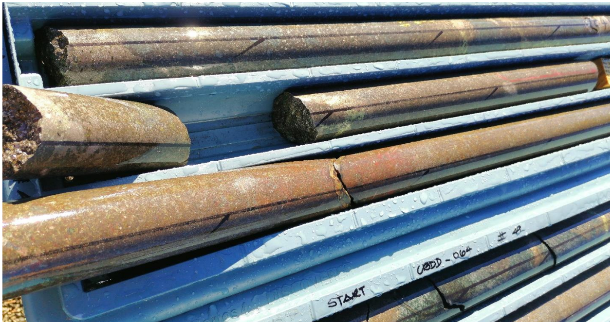
Figure 1: Massive and semi-massive nickel-copper sulphides in CBDD064 at ~198m downhole.

→ Logging and geochemical analysis by CSIRO completed in order to determine Carr Boyd's relationship to the T5 mineralisation. Analysis of the data has commenced.