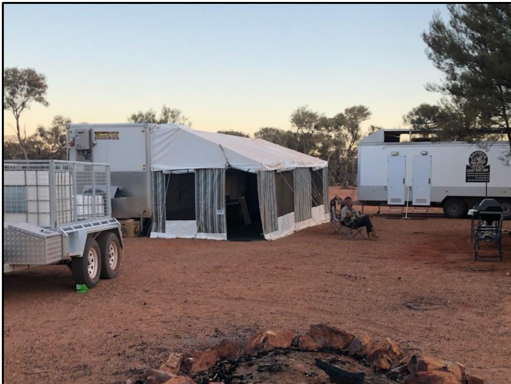
Figure 3: Rosie Camp Set-Up.