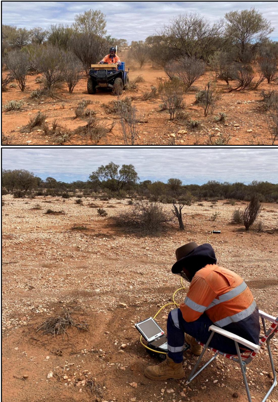
Figure 4 & 5: Surface EM underway.