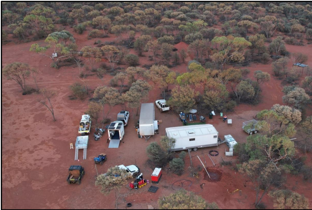
Figure 2: Rosie Camp Set-Up.