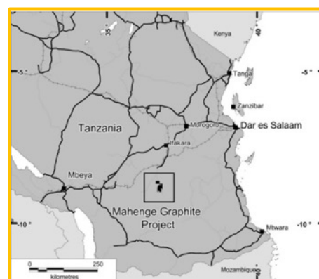
Location of Black Rock's Mahenge Graphite Project in Tanzania

For further information on Black Rock Mining Ltd, please visit www.blackrockmining.com.au