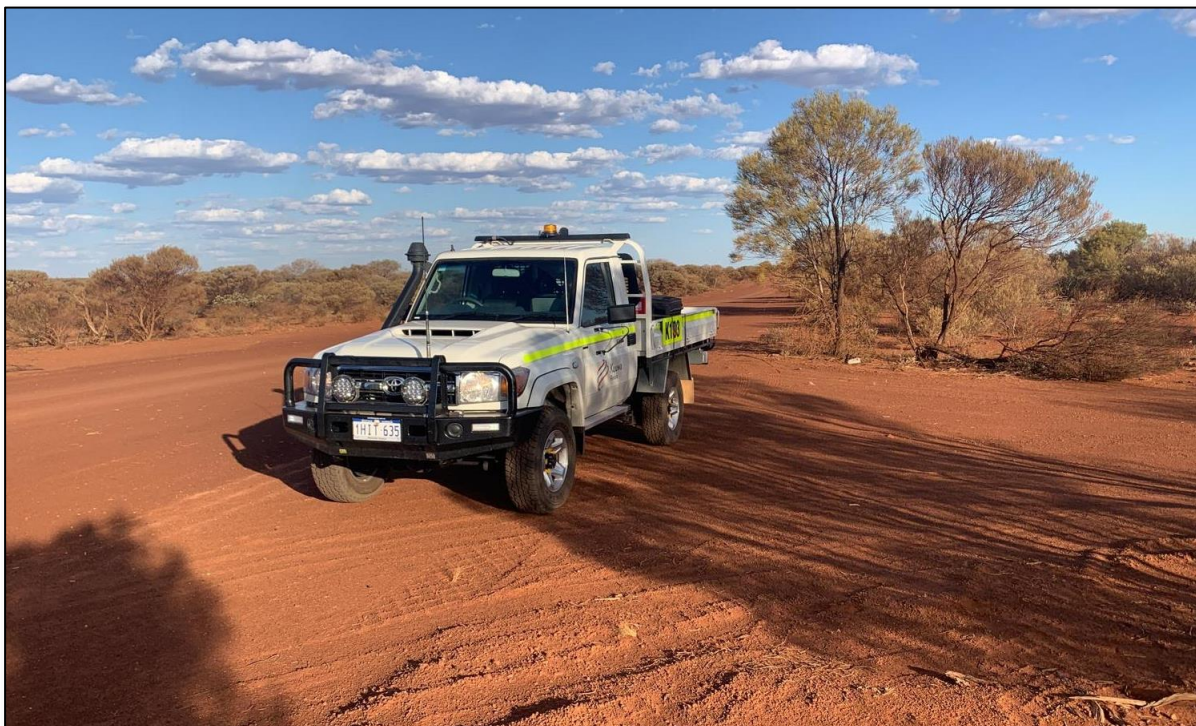
Figure 1 - BPM vehicles enroute to the Company's Hawkins Project, located in the Earaheedy Basin

The Company has mobilised a fly camp to support the Heritage Survey (Fig. 1) with earthworks to be completed over the next two weeks and all other drilling approvals in place for the drilling contractor to begin work in early April.