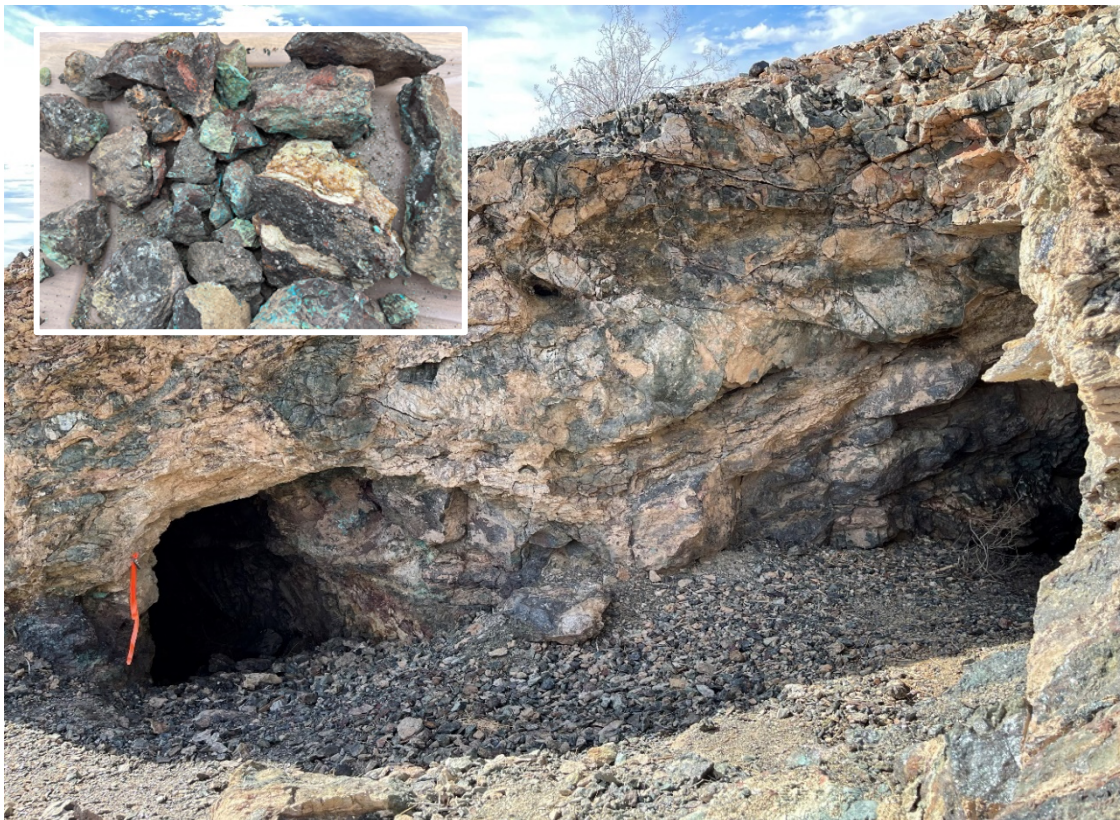
Figure 4. New Standard mine area adits and inset, sample from adit entrance returning 4.62% Cu (773170E, 3780669N).

Mineralisation, as described by SRK, is characteristic of Iron Oxide Copper Gold (IOCG) systems consisting of specularite with subsidiary copper oxides, commonly chrysocolla with minor malachite and tenorite, typically as veins and less commonly as stockwork veining found in both the footwall and hangingwall of the more prominent veins. Magnetite is only locally extant and usually absent from the iron oxide ( \pm copper oxide) veins.