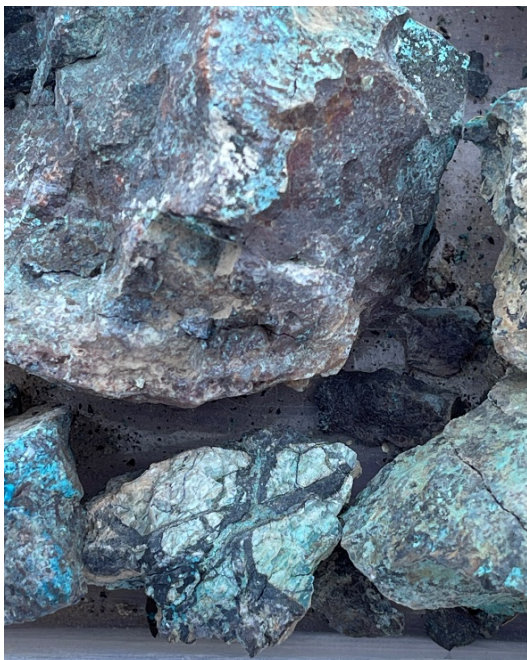
Figure 3. Sample NSM-21-032: 16.8% Cu and 8.48g/t Au (772413E, 3781087N)

SRK concluded that, based on geological observations, the New Standard Project appears to be part of an Iron Oxide Copper Gold (“IOCG”) system associated with a copper porphyry. Other workers have suggested IOCG systems in this area of Arizona may be associated with detachment structures of a possible amagmatic origin. The area is complicated by significant structural disruption, which may have offset mineralisation from the metal’s source. Further mapping and mineralisation studies are required to determine the exact nature of the mineralisation.