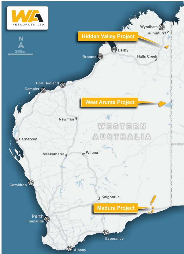
Figure 1: Location of WA1's Exploration Projects

The Company currently has three exploration projects in Western Australia, being the West Arunta, Madura and Hidden Valley projects.