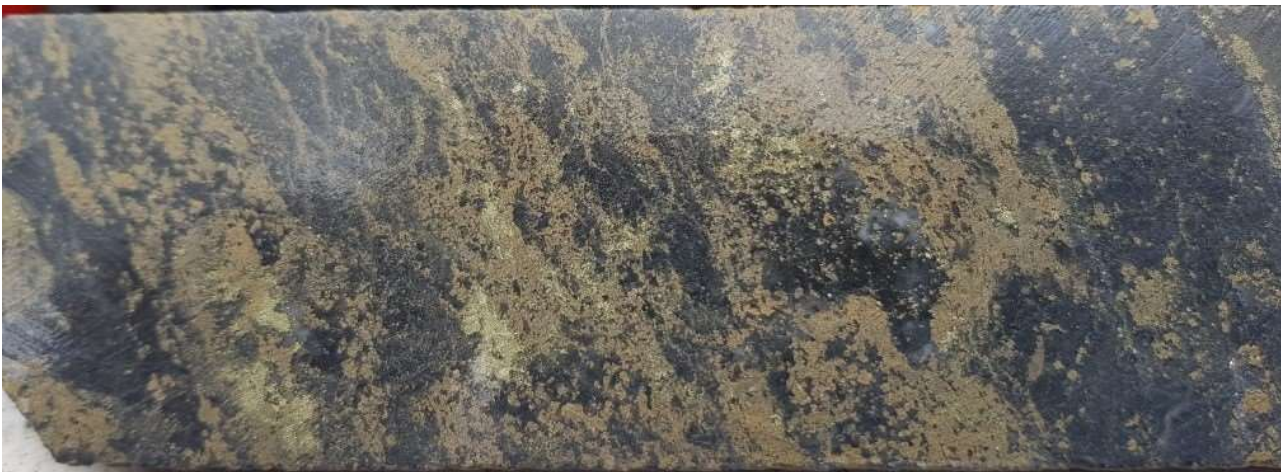
Figure 1: Close up images of half core with pyrite-chalcopyrite sphalerite-galena mineralisation (Diamond drill hole CRR21DD_07A, Scale: NQ core 50mm diameter variety)