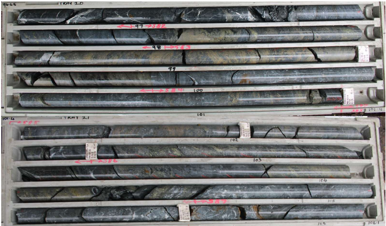
Figure 2: Sulphide Mineralisation intersected in Hole 07A (Diamond drill hole CRR21DD_07A, Scale: NQ core 50mm diameter variety)