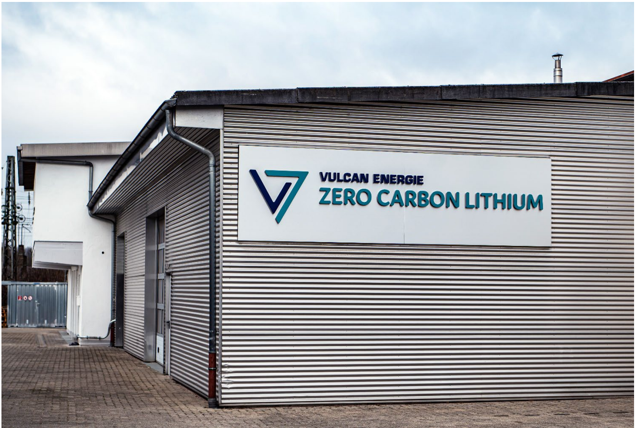
Vulcan's newly opened laboratory in Durlach-Karlsruhe

Importantly, the acquisition of new instruments including an ICP-OES and an IC, enhance the team's efficiency and reduces analysis waiting time. The brine can be fully characterised rapidly, and the team can gather information and react fast to support operation at the pilot plant.