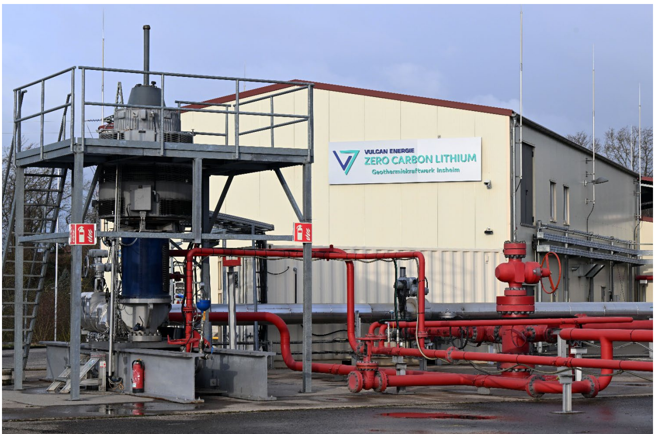
Vulcan's geothermal renewable energy plant, currently in commercial production

Vulcan acquired two electric drill rigs in November 2021 which can drill to the target depth required for geothermal energy wells in the Upper Rhine Valley, Germany. Refurbishment of the drill rigs has commenced to ensure optimal safety and efficiency during operation. Vulcan's two deep drilling rigs are a scarce, strategic asset for Vulcan, at a time when Germany is seeking to decarbonise its heating and deploy widespread deep geothermal development.