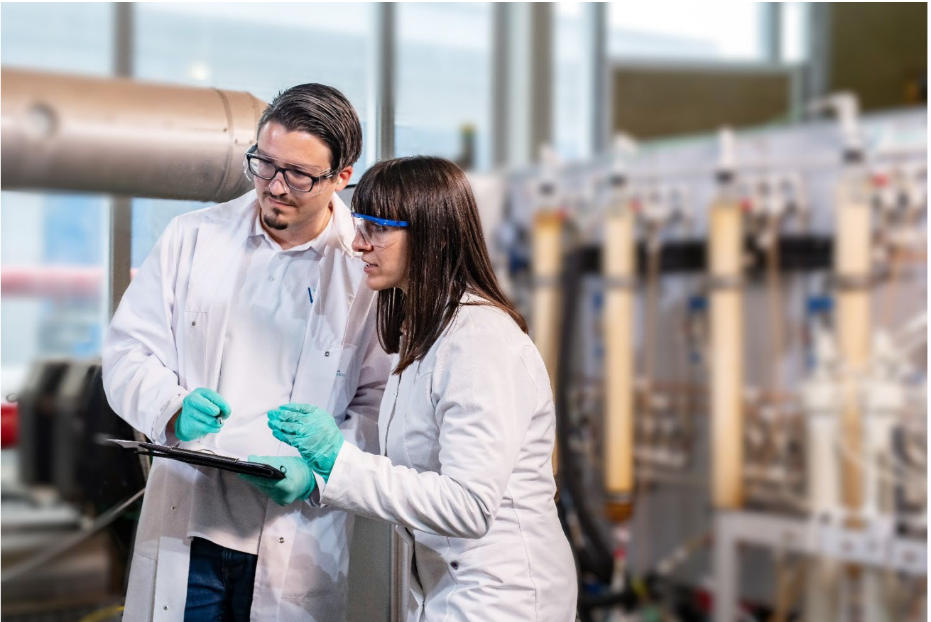
Vulcan's DLE Pilot Plant, successfully in operation for 12 months

This thorough test work produces crucial data needed for de-risking the lithium extraction process. Consistent lithium concentration and low level of impurities are being reported, together with lithium recovery rates averaging 94-95%, which are above the levels noted in the 2021 Pre-Feasibility Study.