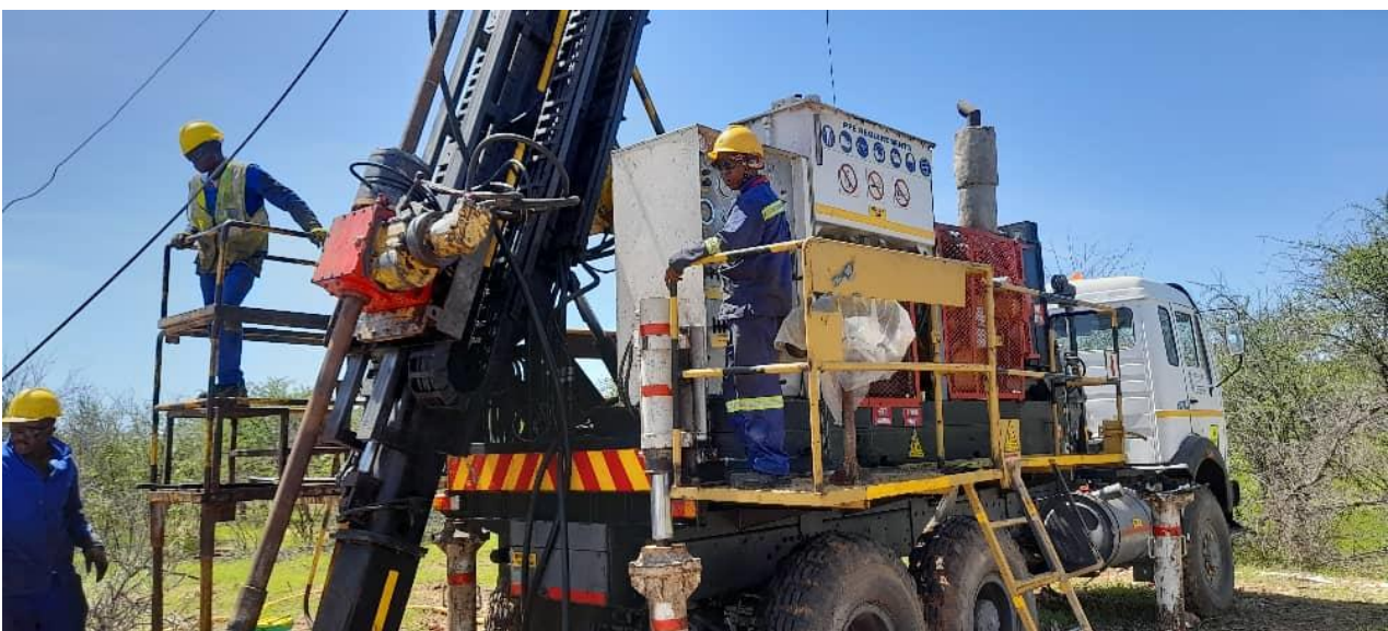
Figure 1: Drilling at Opuwo.

There have been heavy rains on site delaying mobilisation. Drilling is now occurring on two shifts and the remaining 7 holes are scheduled to be completed by end of April. Approximately 4 tonnes of fresh metallurgical sample will be obtained during the program.