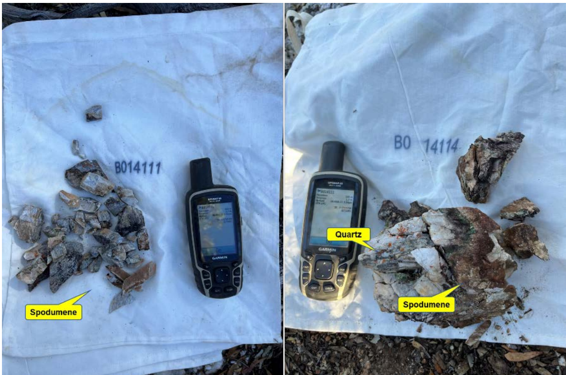
Figure 3: Spodumene bearing pegmatite outcrop located 700m southwest of spodumene at Big pegmatite, MGA50: 769295mE, 627080mN (above) and samples taken from the area (below)