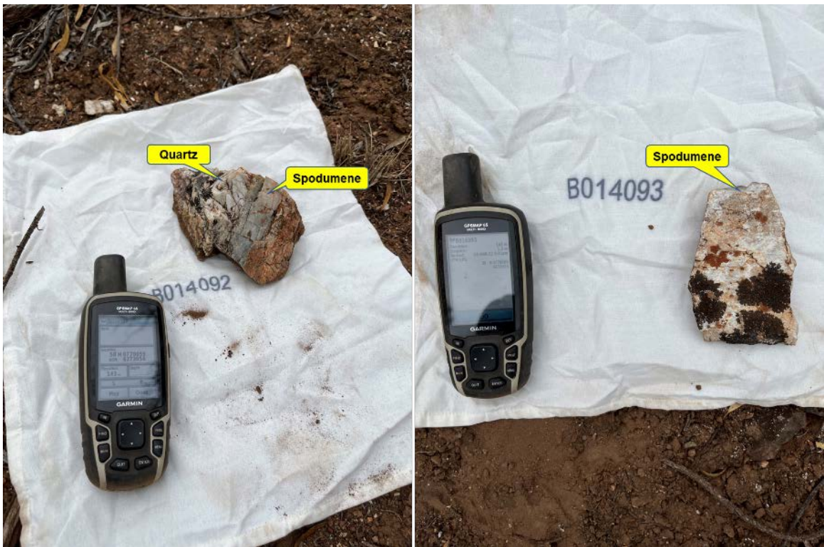
Figure 2: Spodumene bearing pegmatite lag 800m north of spodumene at Big pegmatite, MGA50: 770050mE, 6273050mN (above) and samples taken from the area (below)