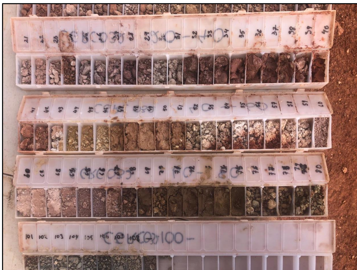
Figure 1: Chip tray for CGRC032 – peak 3.77% nickel value at 74m shown