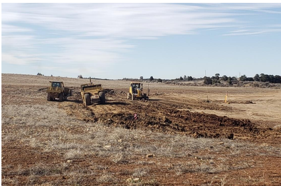
Figure 1: Jesse#1 drill site preparation

Grand Gulf Energy Ltd (ASX:GGE) (“Grand Gulf” or the “Company”) is pleased to provide an update regarding its forthcoming maiden pure-play helium well, Jesse #1. Jesse #1 drill site construction began on 22 March 2022 and is designed to accommodate Aztec Drilling rig #1099 as well as well-head production facilities. The location is expected to be complete by 27 March 2022 in anticipation of rig arrival on 15 April 2022.