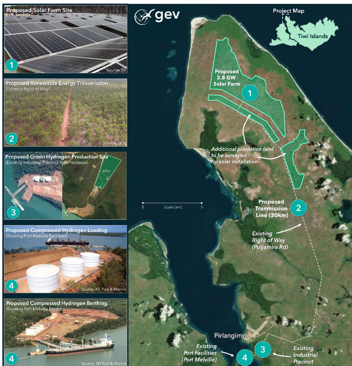
Figure 2: Tiwi H2 Project with additional land for environmental survey