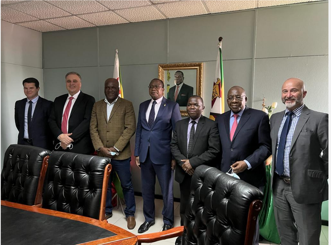
Figure 3 - Invictus & Geo Associates Boards with Hon. Mthuli Ncube Minister of Finance and Economic Development and SWFZ

“I would therefore take the opportunity to reassure our partners that as a Government we fully support the aggressive investment into the oil and gas exploration which they are carrying out and we are confident that this agreement today lays the foundation stone for a vibrant and productive oil and gas sector that will contribute to the creation of jobs, generation of exports and delivery of energy security to Zimbabwe.”