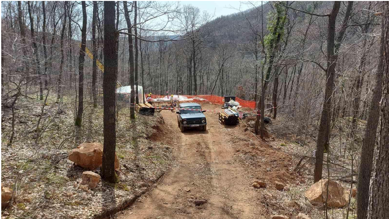
Figure 1 – Commencement of drilling on the Vuzel gold project in Bulgaria