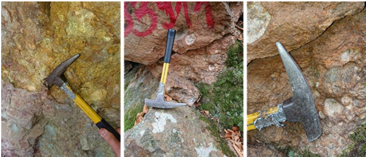
Figure 2 – Examples of altered outcrops on the Vuzel project