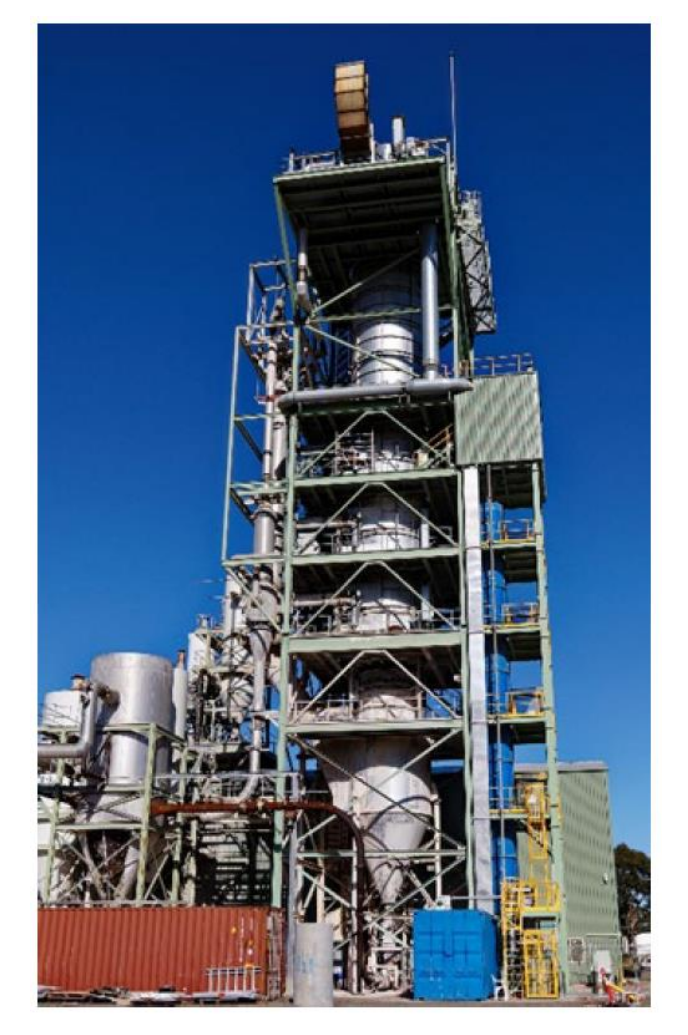
Figure 2 – Calix flash calciner and electric pilot scale plant (BATMn Reactor)

Further, the Calix flash calcination technique is particularly well-suited to the finer fraction of the fines flotation concentrate at Pilgangoora (less than 75µm). This is very encouraging as it has the potential to solve an existing challenge for the industry when dealing with fine flotation products through conventional calcining technology.