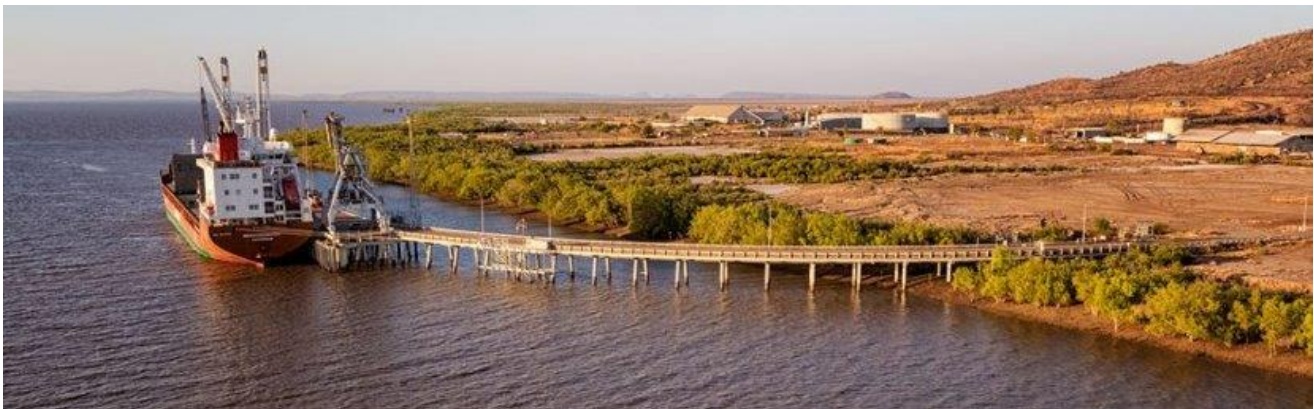
Figure 1: Vessel loading activities at Wyndham Port.

The experience of Cambridge in the region is second to none and we look forward to working closely with them to ensure an efficient and environmentally conscious transfer of our concentrates from Port to Vessel in readiness for their subsequent shipment to our customers.”