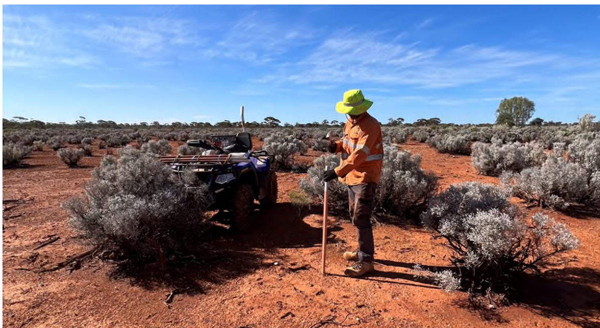
Figure 1: Drill hole collar staking, Mt Monger project, March 2022.

Our exploration team has identified numerous opportunities for both increasing the size and continuity of known gold mineralisation and for potentially making new discoveries and we are keen test these targets with the drilling."