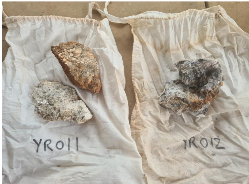
Figure 3. Muscovite and contrasting Grey Lepidolite up to 15% by volume in Pegmatite Samples

Once geochemical vectoring and internal phase analysis of the pegmatites is complete, a reassessment of the untested portions of the outcropping and subsurface pegmatites will be made to determine if ground-based Geochem soil sampling and/or drilling is supported.