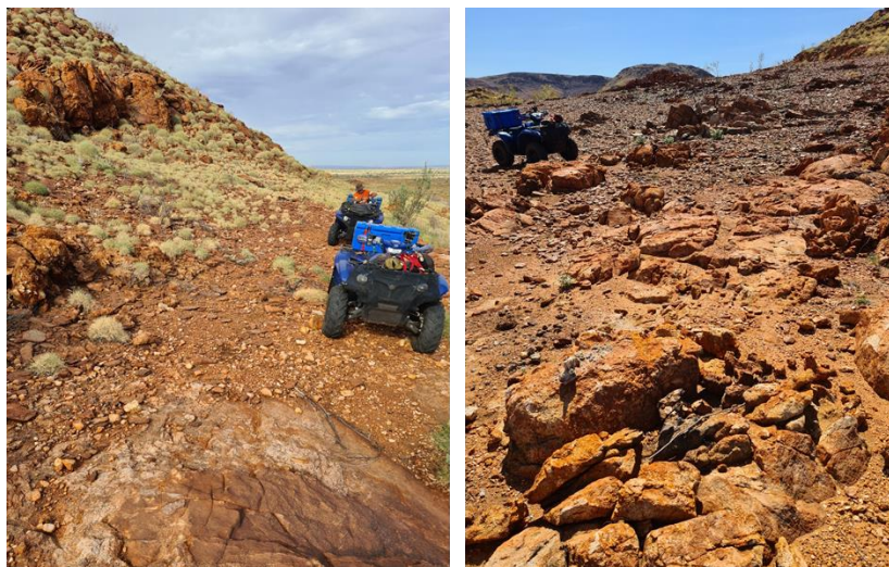
Figure 2. Thick south dipping pegmatite bodies located within the tenement package.

The thick, parallel, and shallow dipping nature of the south dipping pegmatites makes them an attractive exploration target. Areas without modern rock chip sampling were prioritised to assess if the apparently thick pegmatites were mineralised with LCT suite minerals.