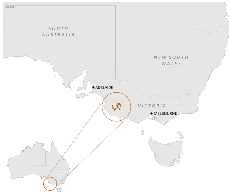
Figure 1: Regional setting of Mitre Hill Project tenements in emerging Rare Earths precinct.

Resource Base Limited (ASX:RBX) (Resource Base or the Company) is pleased to advise that its second and largest, at 809km 2 , Mitre Hill Project Exploration Licence has been granted. Located in South Australia EL6708 Exploration Licence was granted over Exploration Licence Application ELA2021/00059.