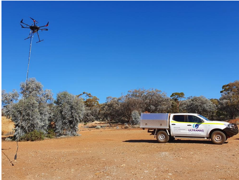
Figure 2. Ultramag drone survey underway at the Rocky Dam Project.