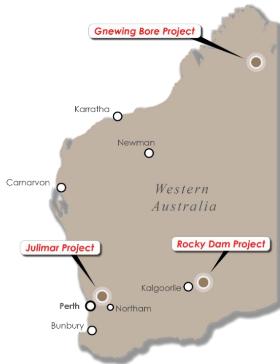
Figure 4. Lycaon Resources three major projects located in Western Australia.

The Rocky Dam Project lies within a favourable setting for orogenic gold and base metal-rich Volcanic Massive Sulphide-style (VMS) styles of mineralisation with multiple other prospects identified throughout the tenure. The large-scale supergene gold mineralisation recorded in historical drilling demonstrates a fertile project area potentially active during major Yilgarn greenstone mineralisation events, which presents a great opportunity to potentially discover primary bedrock mineralisation that may be the source of the supergene enrichment.