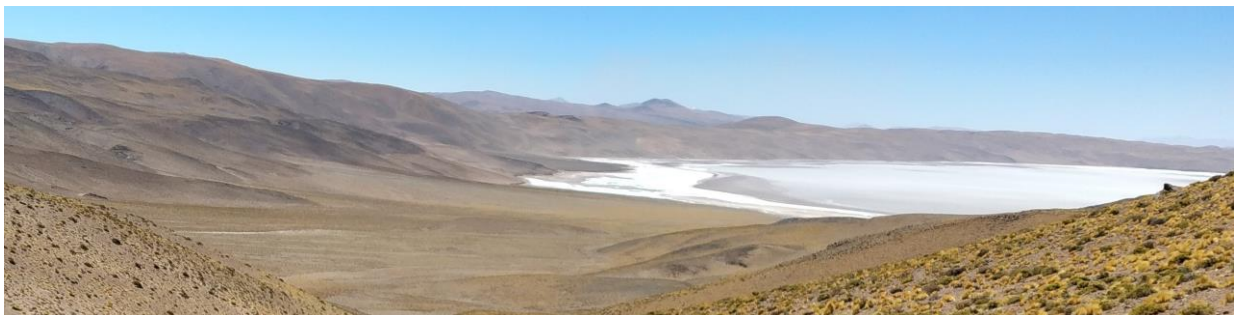
HMW Project looking north from Pata Pila

Greenbushes South Lithium Project: Galan has an Exploration Licence application (E70/4629) covering a total area of approximately 43 km 2 . It is approximately 15kms to the south of the Greenbushes mine. In January 2021, Galan entered into a sale and joint venture with Lithium Australia NL for an 80% interest in the Greenbushes South Lithium project, which is located 200 km south of Perth, the capital of Western Australia. With an area of 353 km 2 , the project was originally acquired by Lithium Australia NL due to its proximity to the Greenbushes Lithium Mine ('Greenbushes'), given that the project covers the southern strike projection of the geological structure that hosts Greenbushes. The project area commences about 3km south of the current Greenbushes open pit mining operations.