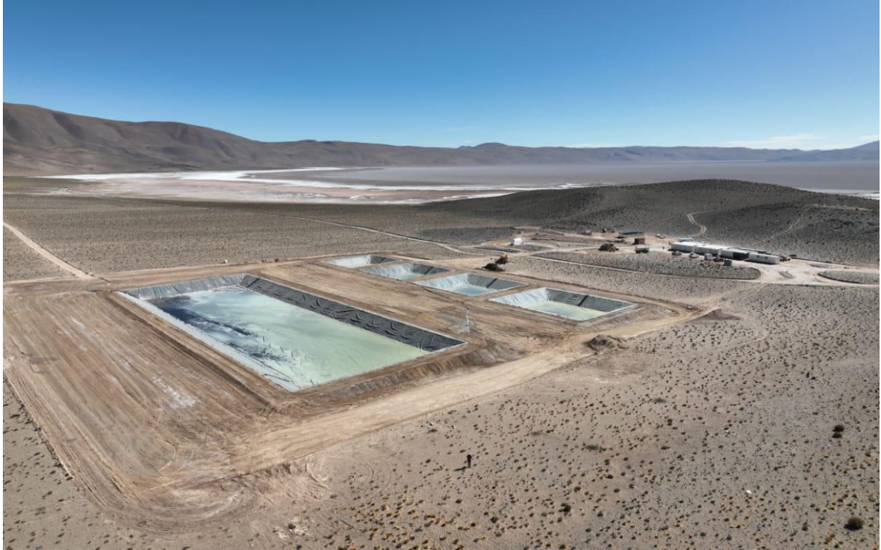
Figure 3 – Aerial view of S1 pond filling with brine with camp and the Hombre Muerto salt flat in the background. Evaporation testing ready to commence.

This is a major milestone given that it marks the commencement of large-scale piloting activities at the HMW Project. The data set to be obtained from this initial evaporation trial will allow the calibration of the simulation model to predict the completion time for achieving the first batch of brine concentrate with 6% of Li contents produced by the Pilot Plant.