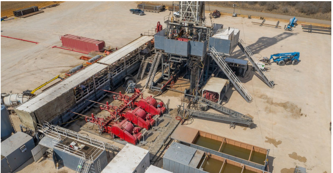
Figure 1. Kenai Rig 18 drilling the Flames Well, Carter County, Oklahoma

Continue to drill ahead in the horizontal section of the wellbore toward the targeted total measured depth.