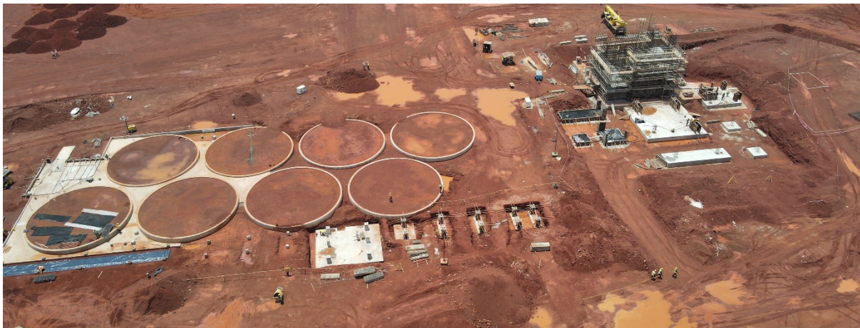
Figure 2: Overview showing location of CIL tanks and SAG Mill