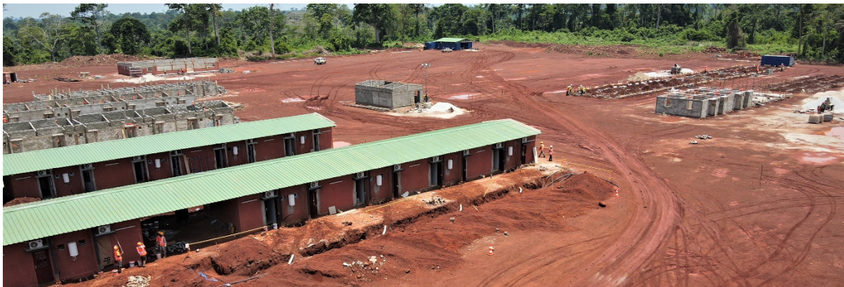
Figure 4: Mine Camp under construction