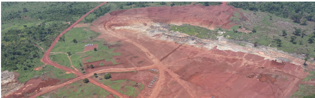
Figure 5: TSF clearing