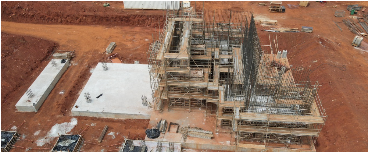
Figure 1: SAG mill free bearing second lift formwork installation

Construction is tracking well against schedule with progress achieved at the plant as SAG mill concrete moves to installation of formwork for the second lift, installation of roofing for the kitchen building, and clearing for the TSF. Figure 1 to Figure 5 show the progress achieved on site during March 2022.