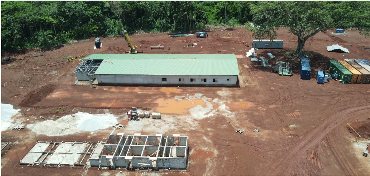
Figure 3: Kitchen roof installation