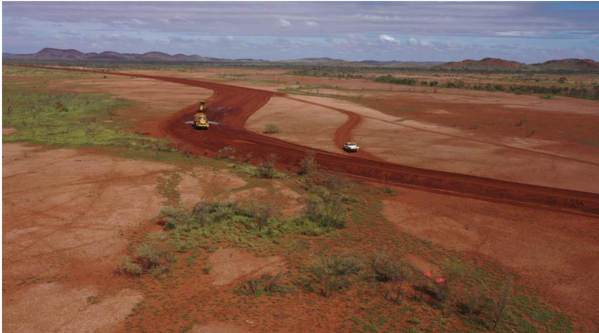
Figure 1: Progress with Construction of Haul Road (1)

We are delighted with the positive progress made with the Paulsens East Haulage Road. With contractors now mobilising to site to commence production, this is a further significant milestone in the development of Paulsens East. With iron ore prices strengthening to above US$150/t, the timing could not be better to bring the Pilbara's next iron ore mine into production.