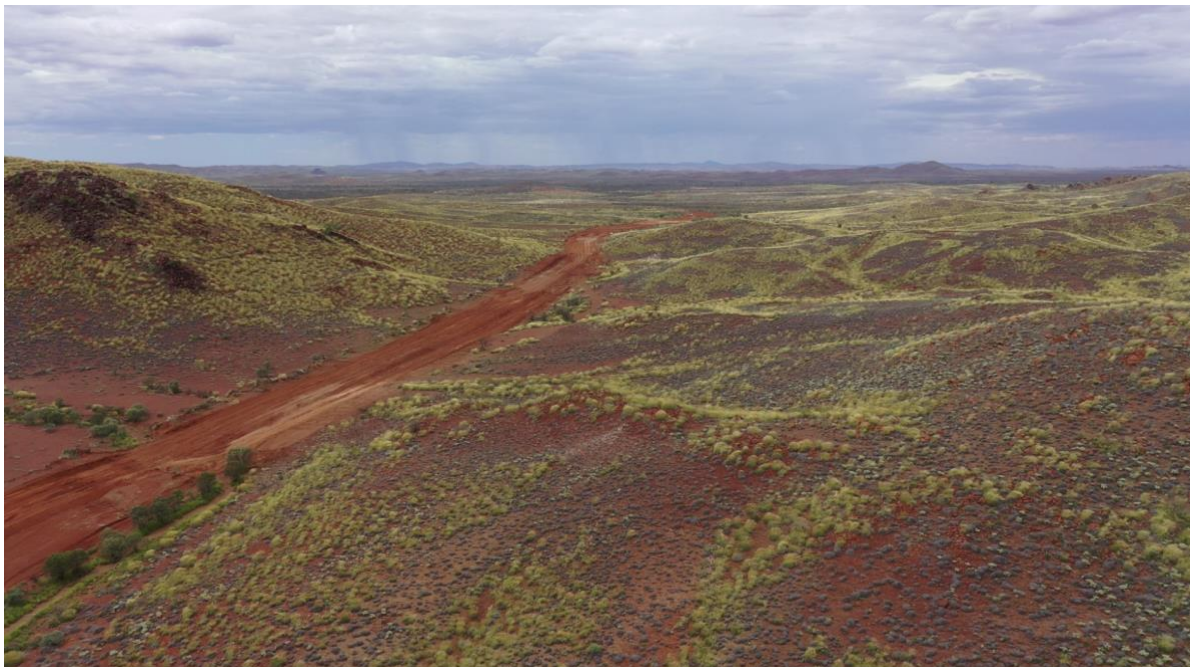
Figure 2: Progress with Construction of Haul Road (2)