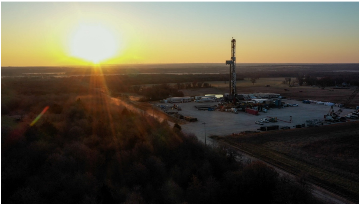
Figure 1. Kenai Rig 18 drilling the Flames Well, Carter County, Oklahoma

Continue to drill ahead in the horizontal section of the wellbore toward the targeted total measured depth.