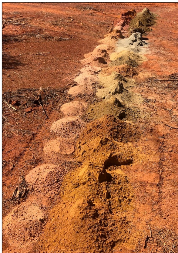
Figure 2. Aircore drilling sample piles from 2022 drilling programme. Note highly interesting and prospective colour of sample piles.

Initial lithological and alteration observations are very encouraging (see Figure 2 below) and has seen numerous intersections typical of the rocks that host gold in the area. The Company has begun sending samples to the laboratories for assay and is eagerly awaiting results which Metalicity anticipates will drive forward and expand existing mineralization and pave the way for further testing of these targets in future exploration drilling campaigns.