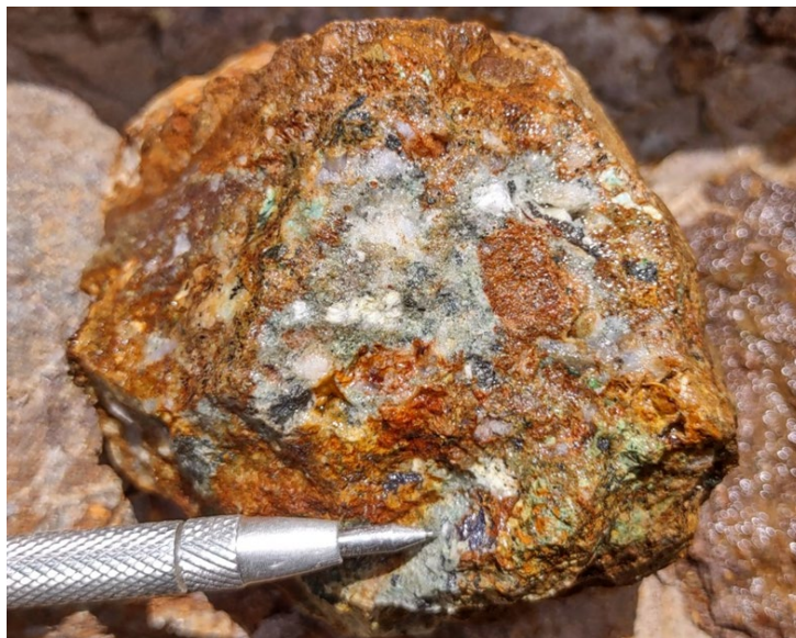
Figure 2: Picha Project – mineralised samples from the Huancune target

A single rock chip was taken from the Ajencorani target located in the northeast corner of the Project. This sample returned anomalous results with 282ppm Cu and 388ppm Zn. Further sampling is required in this target area.