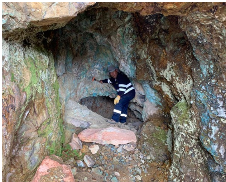
Figure 3: Picha Project – Historical mine workings at the Pacojahua target