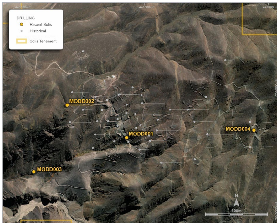
Figure 1: Mostazal Copper Project – Solis Minerals Ltd. diamond drill hole location plan

Holes MODD001 and MODD002 aimed to test the southern and down-dip extensions respectively, of a near surface copper manto system (refer to Figure 1 and Appendix 1, Table 1 for collar location details). Drilling showed an extensively altered system characterised by chlorite + epidote + albite +/- hematite, with copper mineralisation represented by chalcopyrite, bornite and primary chalcocite sulphides.