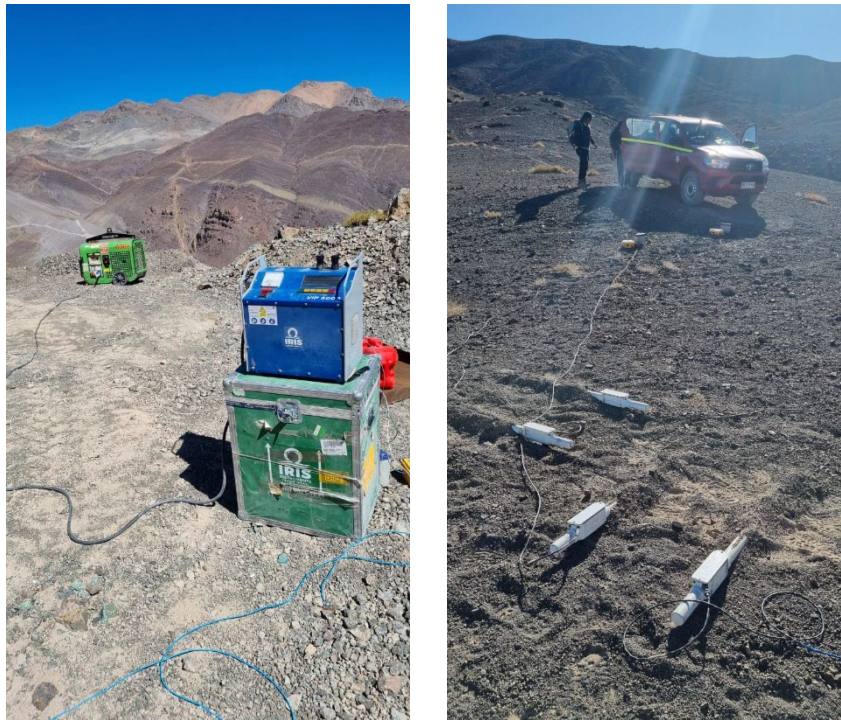
Figure 3: Geophysical crew and equipment on site at Mostazal