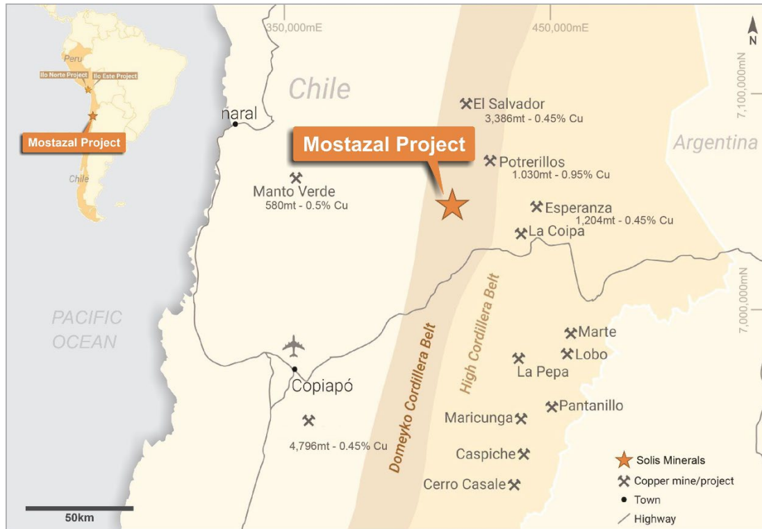
Figure 4: Mostazal Copper Project location