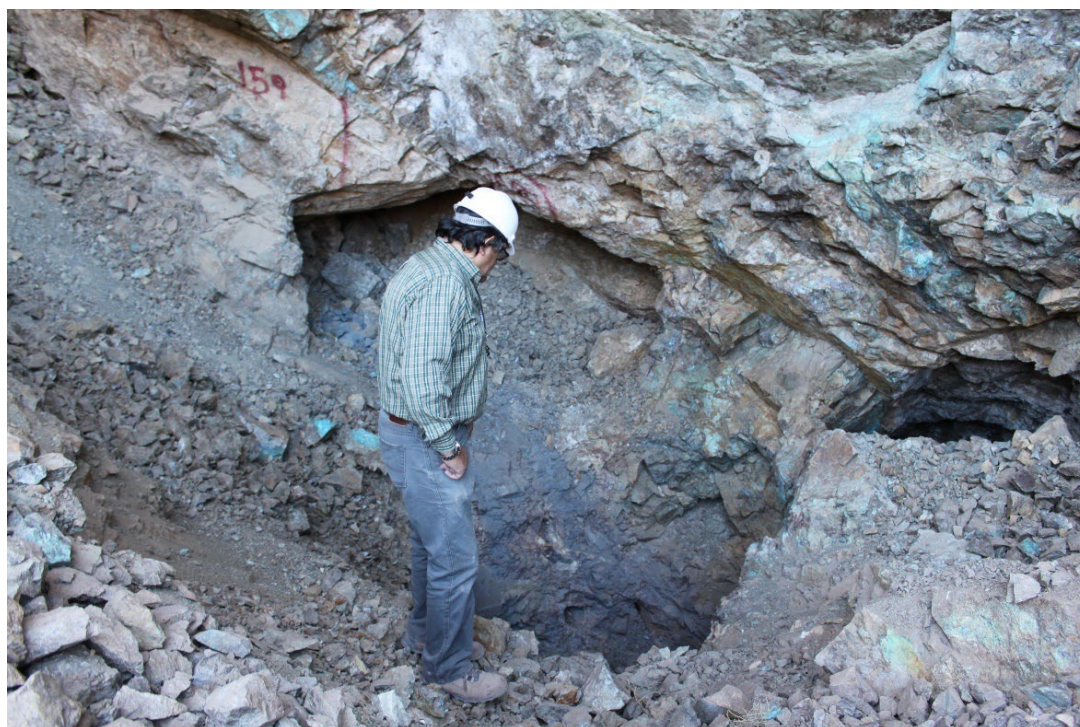
Figure 2: Inspection of mine working developed on shallow dipping copper manto structures

The NNW-SSE and WNW-ESE faults show carbonate, opal silica or carbonate, opal silica fracture fill, with some copper oxide (green) and sulphides (primary chalcocite) observed. The significance of these initial observed structures, and their significance to the wider mineralised system at Mostazal is still to be fully understood. Once the mapping has been completed, this data will be integrated with the historic and new drilling information (including assay results for MODD003 and MODD004 which are yet to be received from the laboratory), enabling the reinterpretation of the Mostazal system.