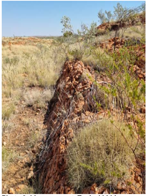
Photo 2: Lion prospect, Typical Lithium Bearing Pegmatite Outcrop at Tambourah