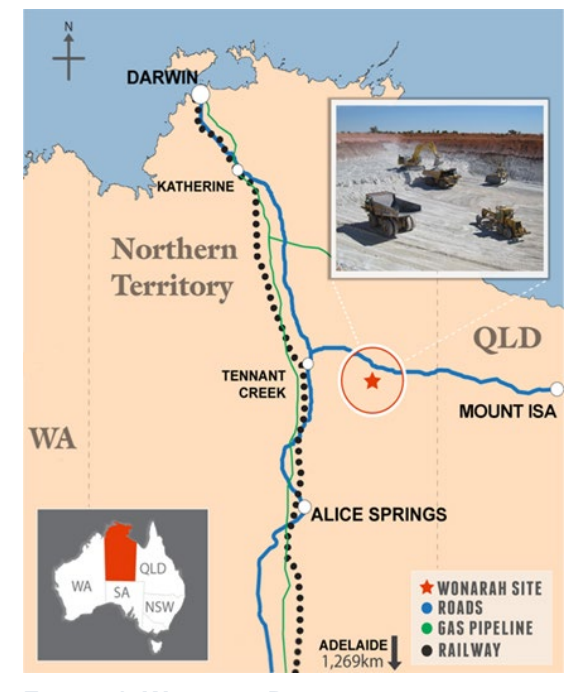
FIGURE 1: WONARAH PROJECT LOCATION MAP