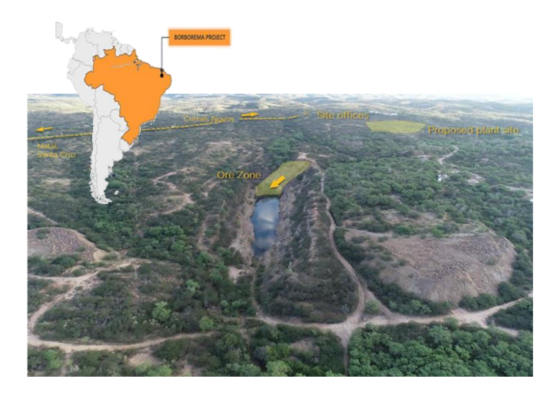
Figure 1. View to the south west over the Borborema pit showing the exposed ore zone and infrastructure.

The Big River Board was encouraged by the initial internal modelling results and has commissioned GRES to undertake a PFS for a Project with a higher production rate design. The Company will update the market as and when the PFS has been delivered, noting that this work is scheduled for completion in the second quarter of 2022.