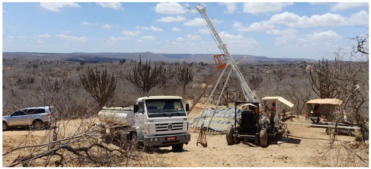
Figure 2 – Diamond drilling in progress at Borborema Gold Project