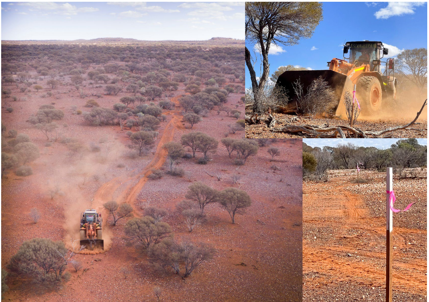
Figure 1. Current drill preparations in progress

Si6 Metals Limited (ASX: Si6 or the Company) is pleased to confirm that Phase 2 aircore drilling at the Monument Gold Project will be commencing shortly. Following approval of the program of works, field crews have mobilised to the project area to commence hole pegging and line clearing. The drill program will test a number of high priority intrusive targets identified from the Phase 1 aircore drilling program undertaken in late 2021. In addition, a number of high priority structural targets located along major regional structures identified from detailed geophysics interpretations will also be systematically tested. The program will consist of 140 drill holes for approximately 5,000m and is expected to take 2 weeks to complete.