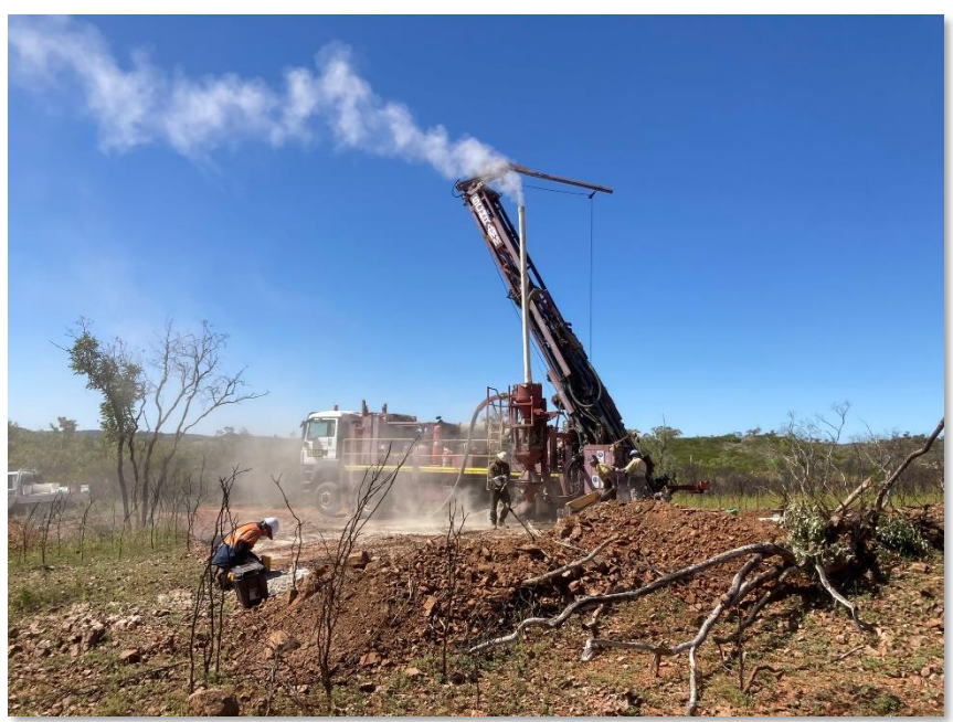
Plate 1: RC Drilling at King Solomon Prospect May 2022