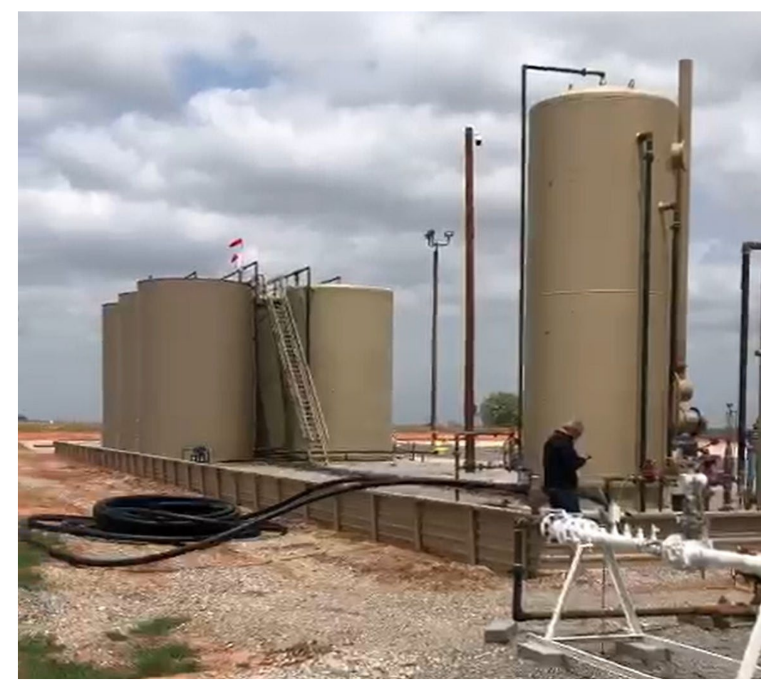
Figure 1. Rangers Well surface production facilities with Lee Francis (Vice President Operations) in the foreground

The Company will update the market with IP24 (peak rate), IP 30 and IP 90 production rates as these are achieved.