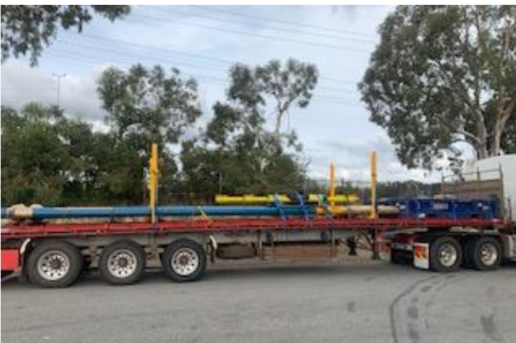
Drilling bottom hole assembly headed to Dampier from Perth