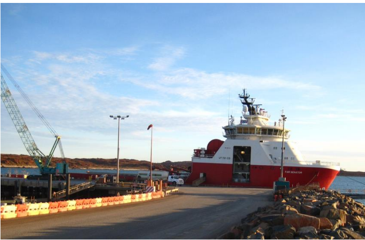
Solstad Far Senator anchor handling support vessel loading at Dampier Wharf