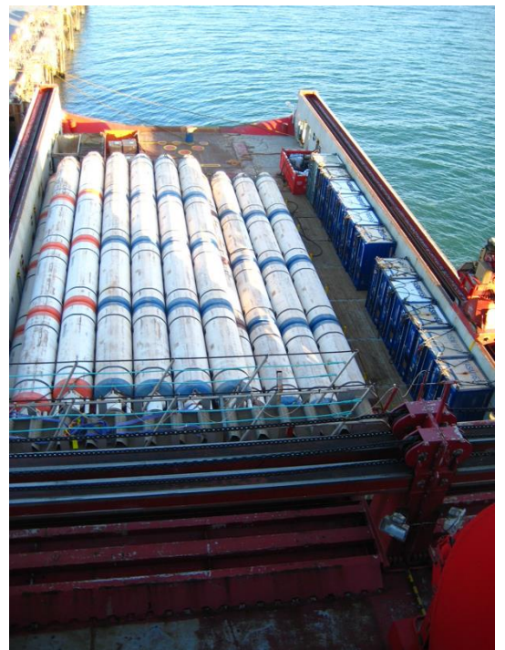
Marine riser loaded on the Far Senator