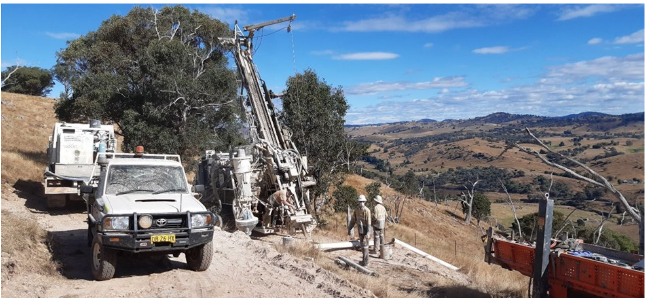
Figure 3: Drilling rig at Hole 3DGIB004 the Gibraltar Mines located down the hill to the right of the rig

What is potentially more exciting about the recent results of 3DGIB003, is the location of this drill hole with regards the regional geology. Since the Company acquired this project it has formulated a view that the key geological control that determines the location of deposits is the presence of NE/SW trending structures with the major N-S (or NNW/SSE) shear zones. The Gibraltar area is a prime target as the NE trending mineralised veins at Gibraltar would intersect the largest shear zone in the region (Wondalga Shear) just 400m to the west of hole 3DGIB003. This shear is located below the Adelong Creek and historical records show that most the alluvial production (400,000oz) came from dredging the Adelong Creek downstream from the Gibraltar mine, so it represents one of the best potential targets for major mineralisation.