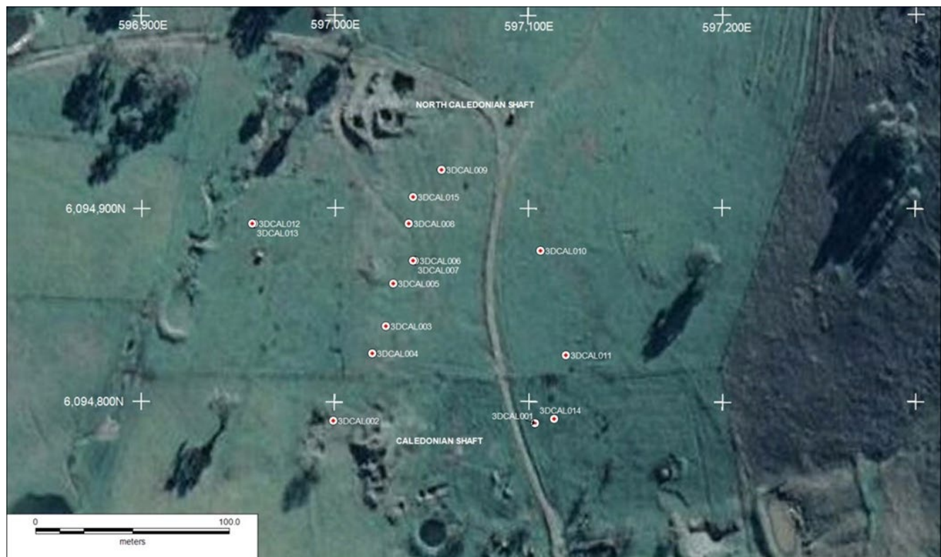
Figure 4 Location of Drill holes at Caledonian with CAL009 located as the Northern most hole