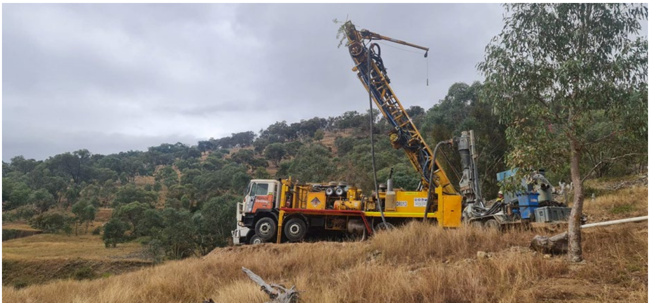
Figure 1: Drilling Rig setting up to drill hole 3DGIB003

The Gibraltar drilling program was exploratory in nature as there had been very limited drilling in the past, despite the Gibraltar mine historically being one of the largest gold producers in the Adelong Goldfield. Much of the historical production had come from a single high grade narrow vein deposit “Main Vein” worked extensively in the O’Brien Shaft workings which produced about 140,000oz at an average grade of 34g/t Au.