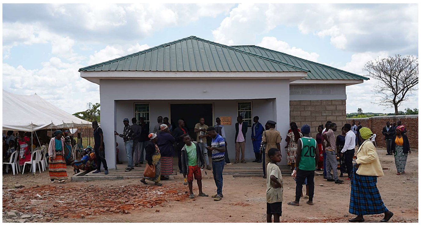
Figure 5: The entrance of the Community Centre

Sovereign has recently completed the construction of a new Community Centre in Malingunde. The Community Centre is designed to establish a central point for the Malingunde community to gather and host events.