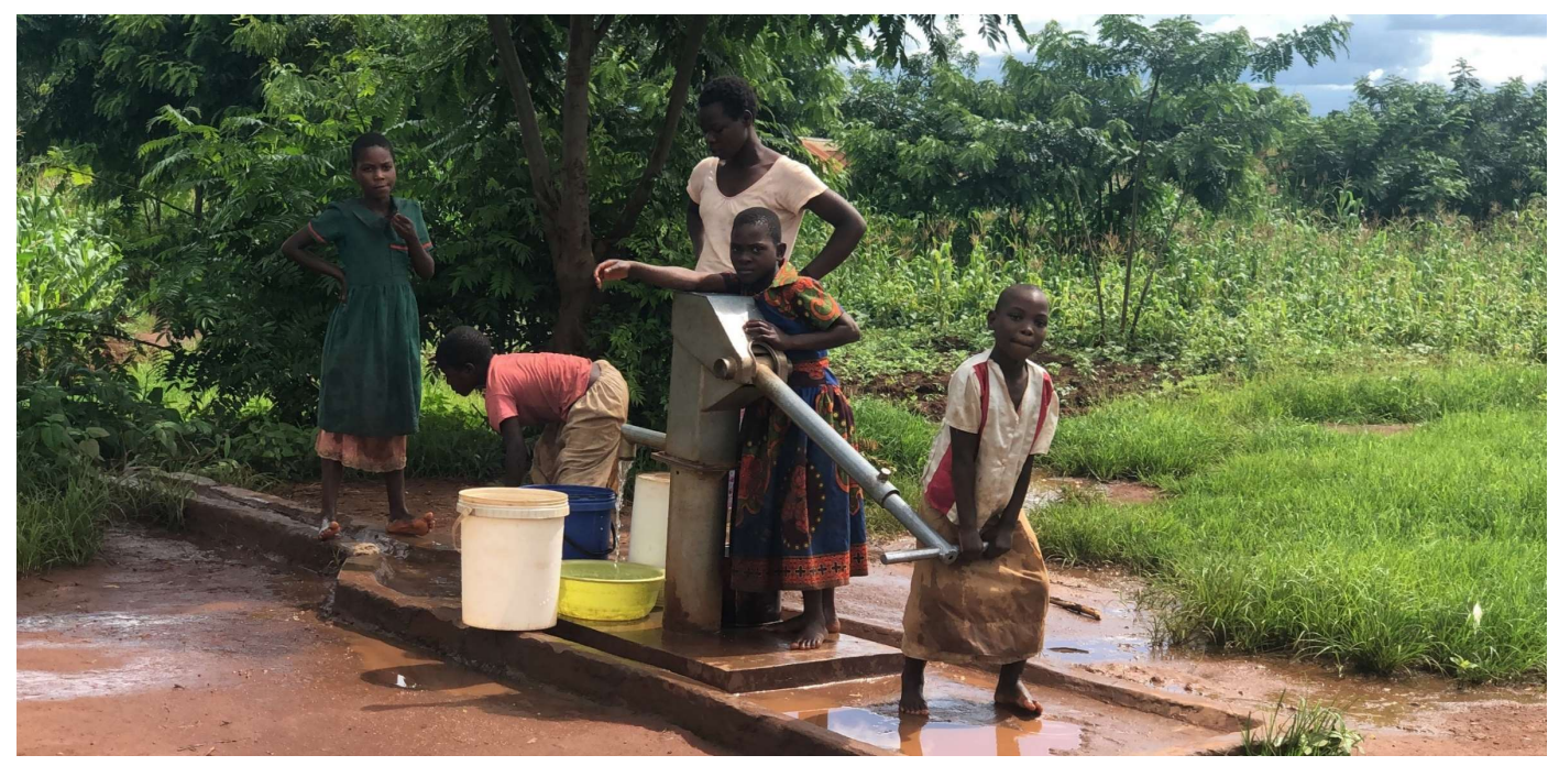
Figure 7: Water bore installed by Sovereign

To provide local communities with drinkable water. Sovereign has commissioned four water bores across its licence area. The water bores save the local communities transit times and provide a clean source of water.