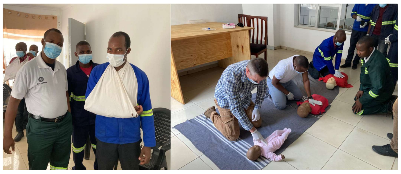
Figures 8 & 9: Sovereign employees during first aid training