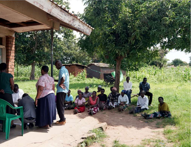
Figure 10 & 11: Community liaison officers discussing Sovereign's future plans for exploration work in the area and how it relates to the communities