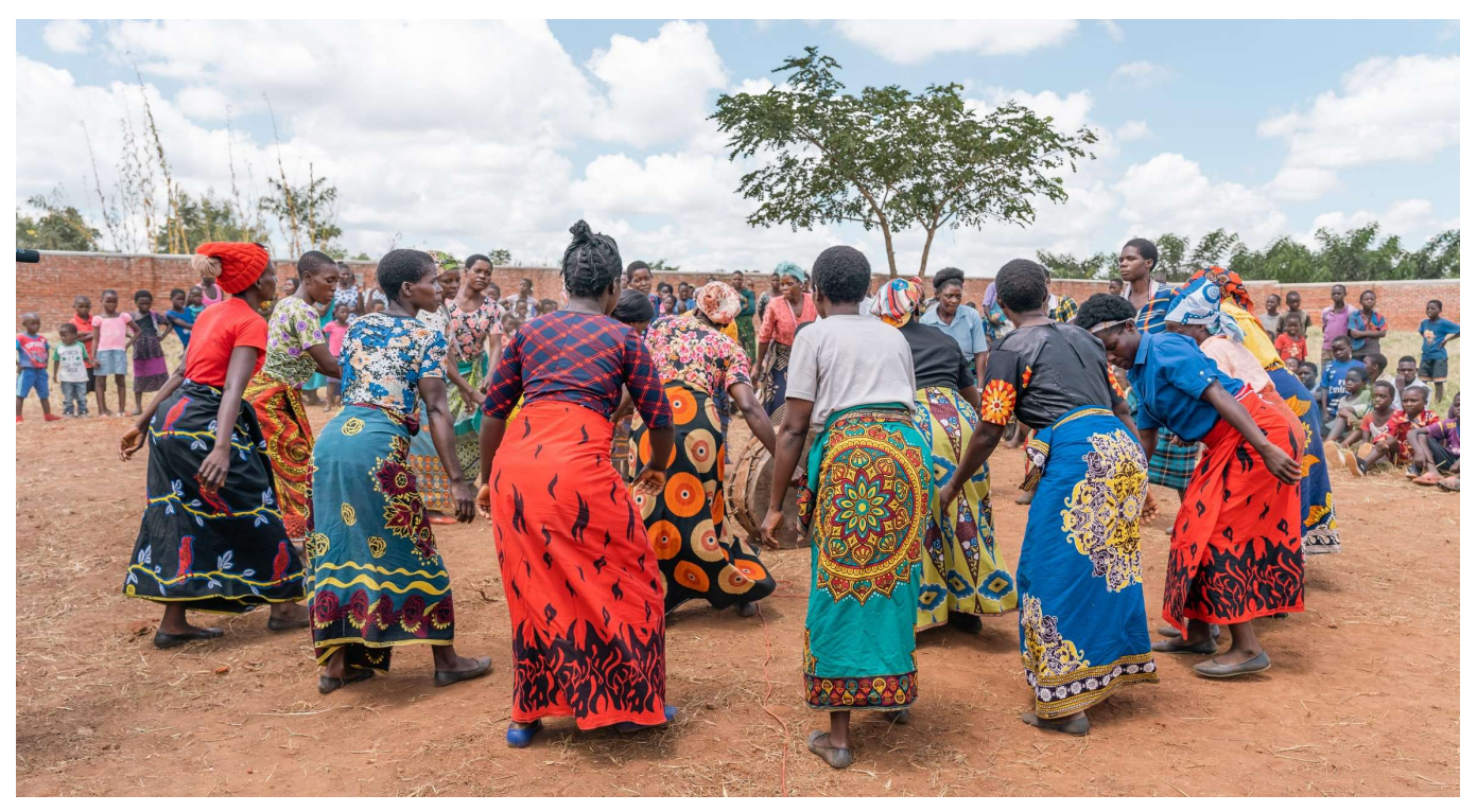
Figure 6: Traditional dance at the opening ceremony of the community centre