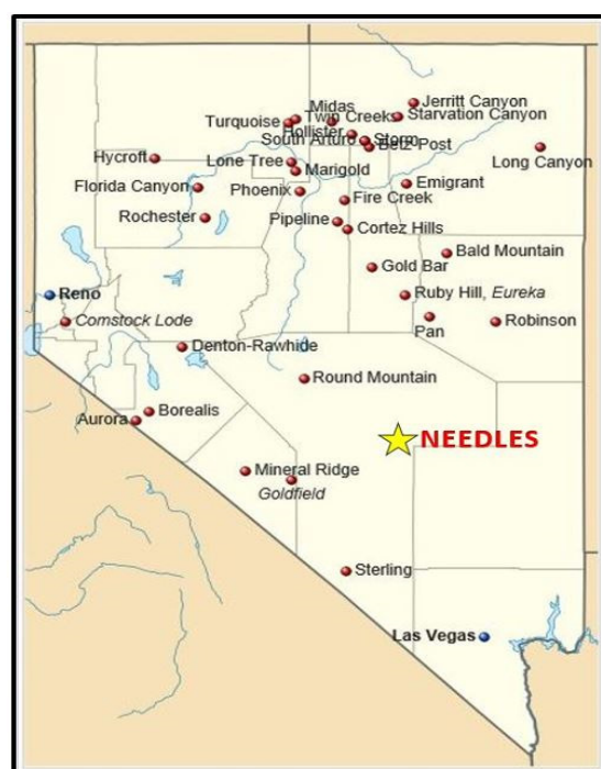
Figure 1. Needles Project Location and active gold mines

Based on the assay results previously reported from holes 1, 2 and now hole 3, it can be concluded that the main DC/IP chargeability anomaly has defined pyrite mineralization in the andesites and dacites, but assays suggest that the pyrite does not carry significant gold or any base metal mineralization.