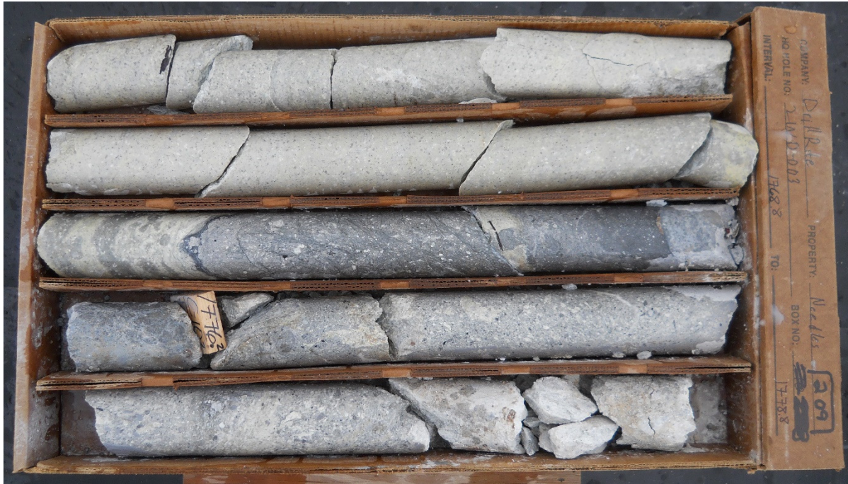
Figure 3. Example of pyrite veined andesite in hole 21ND_003 Box 209 from 1,768.8 to 1,778.8 feet (539 to 542m) - propylitic altered andesite and dacites with disseminated pyrite [1-2%].