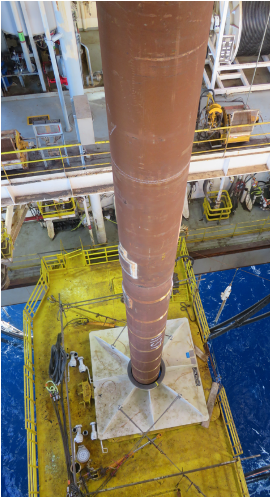
36" Conductor and mudmat being made up prior to deployment.