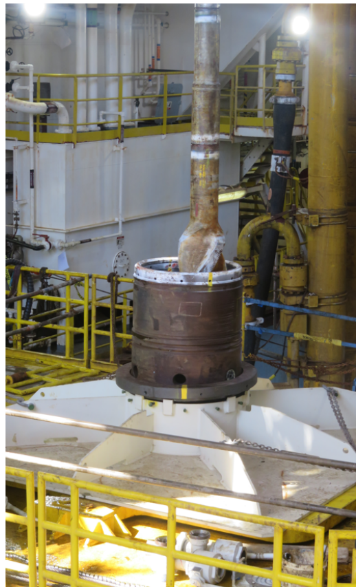
Downhole drilling assembly and installation within the well head housing on the mudmat