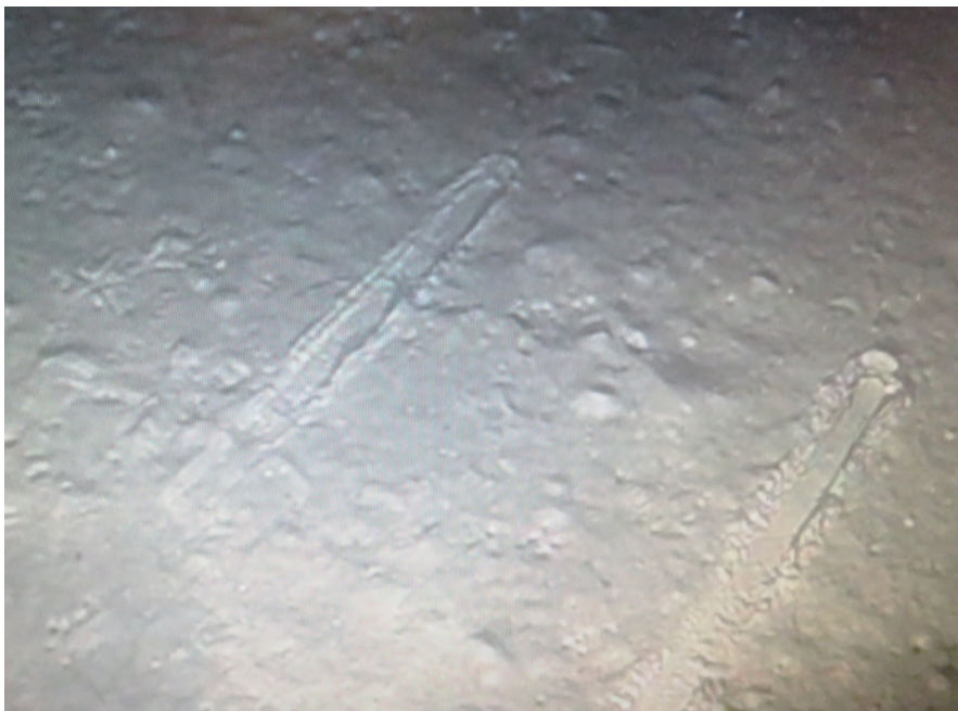
Drilling location marked on sea floor prior to spud by ROV.