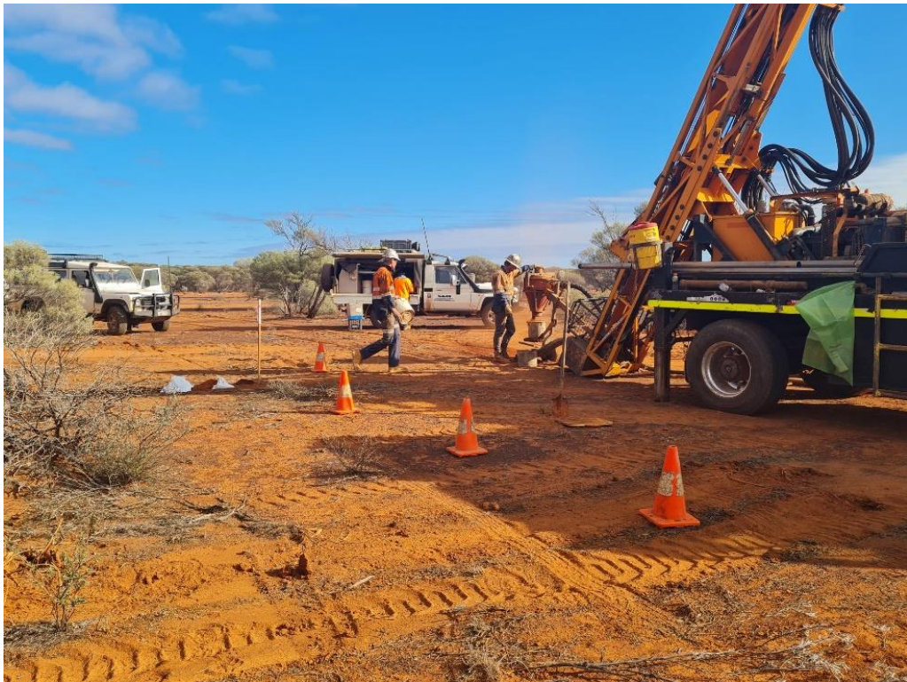
Figure 1: Aircore drilling at Kookynie Gold Project