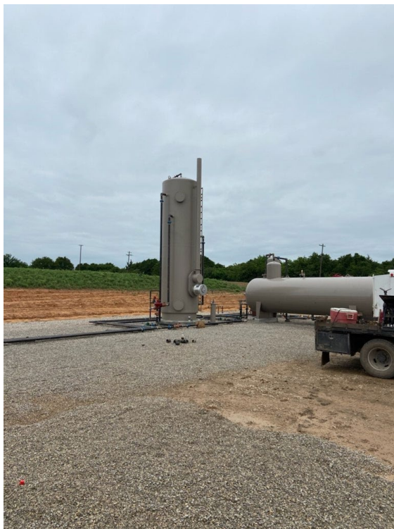
Figure 3. Surface production facilities