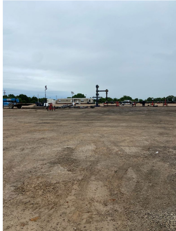
Figure 2. Well christmas tree plumbed in ready for completion activities