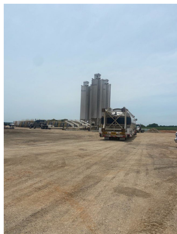
Figure 4. Completion equipment mobilisation with sand tanks in the background