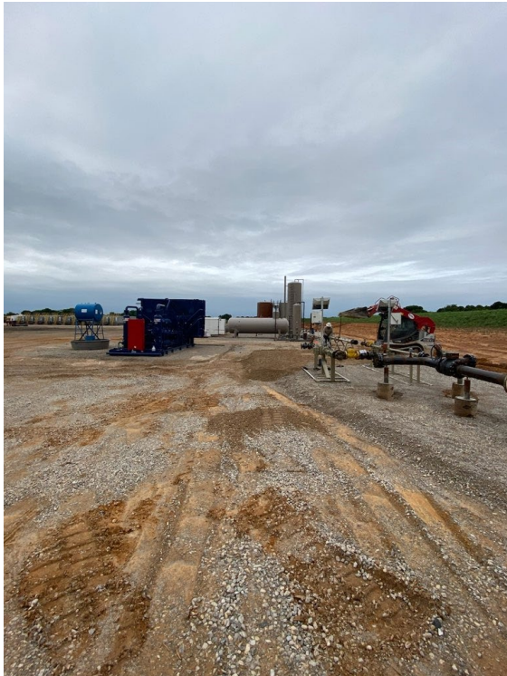
Figure 1. Plumbing in of surface production facilities