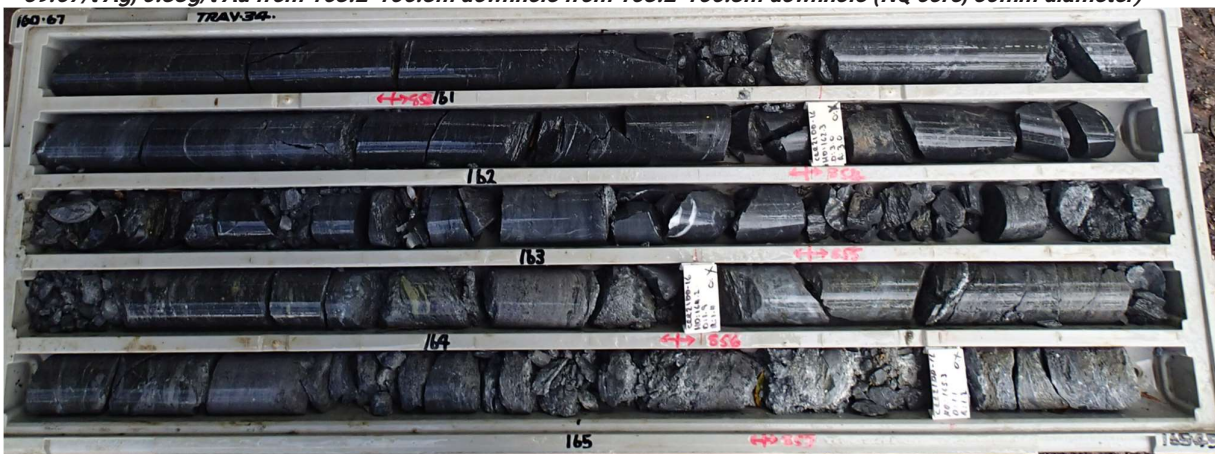
Figure 4: CRR21DD_016, detail from above Figure 3 of Samples (42)855 (top row) and (42)856 (bottom row) that extended from 163.20-165.10m downhole) exhibiting massive sulphide – sampled interval assayed 12.72% Zn, 6.25% Pb, 1.72% Cu, 44.62g/t Ag, 0.46g/t Au (NQ core, 50mm diameter)