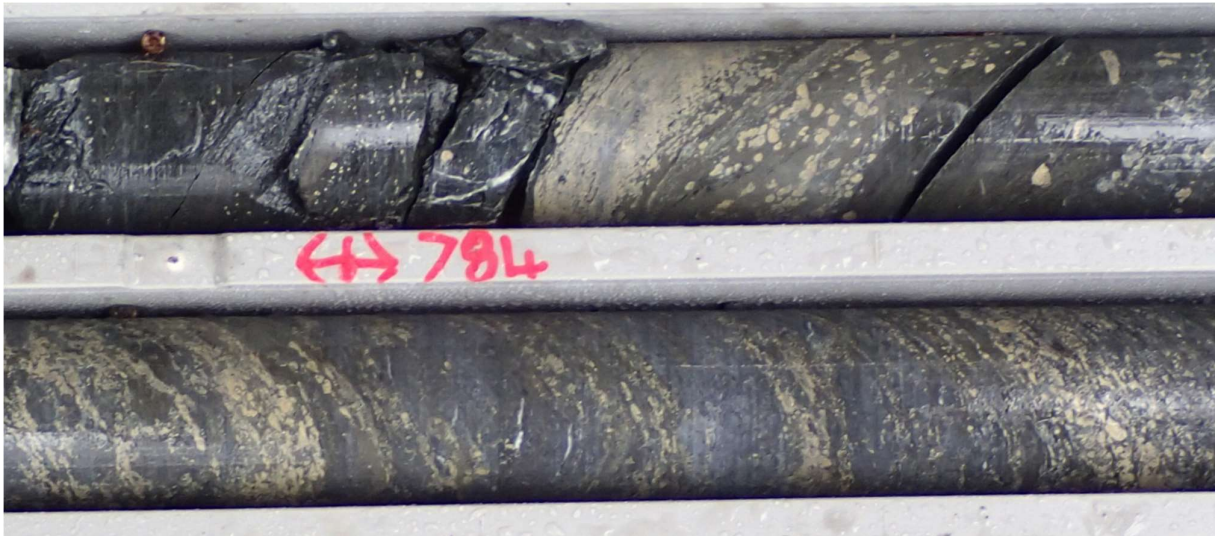
Figure 3: CRR21DD_16, interval comprising samples 42855-42857 assaying 3.1m @ 9.21% Zn, 4.66% Pb, 1.97% Cu, 59.67/t Ag, 0.33g/t Au from 163.2-166.3m downhole from 163.2-166.3m downhole (NQ core, 50mm diameter)