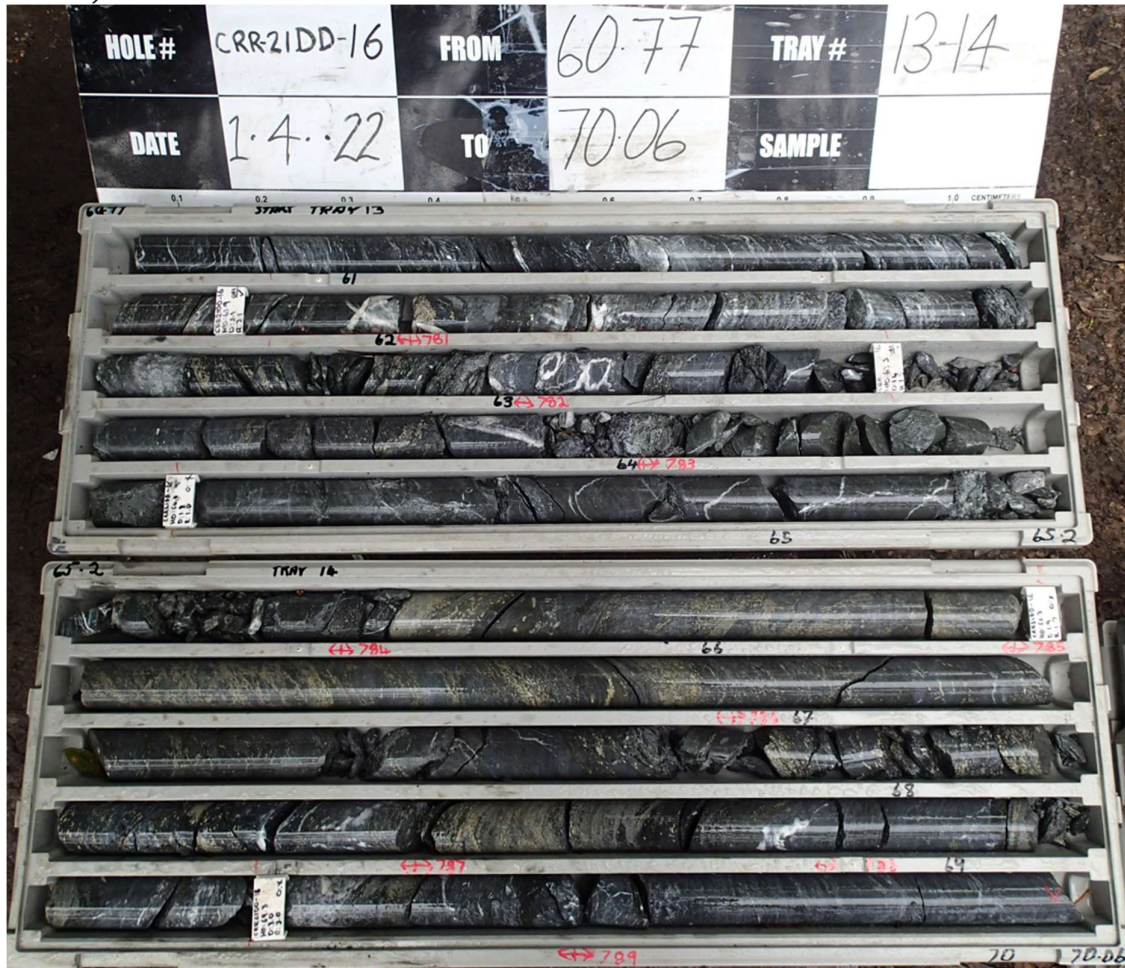
Figure 1: CRR21DD_16, interval comprising samples 42781-42788 assaying 7.6m @ 5.9% Zn, 1.16% Pb, 0.19% Cu, 7.23g/t Ag, 0.03g/t Au from 62-69.6m downhole including 1.3m @ 13.47% Zn from 65.60-66.90m (NQ core, 50mm diameter)