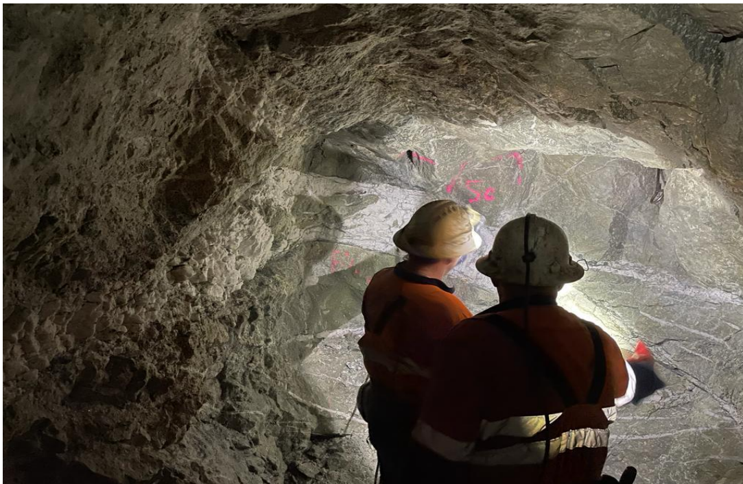
Figure 1: Miners inspecting the newly discovered “Sovereign” high-grade gold reef at the A1 Mine

The first drill hole from the A1 Mine drilling programme returned an exceptionally high-grade interval of A1UDH-472: 4.6m @ 135.7 g/t gold from 36m (ASX - 2 May 2022). This hole was targeting near term mining targets to the south of the Queens lode where very little previous drilling has been conducted. Further results from near this position have returned unexpectedly numerous zones of deeper mineralisation and a best intercept of: A1UDH-476: 1.92m @ 43.2 g/t gold (82.9 g x m’s) – see Table of drill results. These results are very encouraging (Figure 2). This particular interval represents an interpreted extension of the Sovereign Lode. The drilling programme is ongoing.