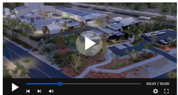
Fly-through of the Stage 1 new EcoGraf HF free ™ BAM Facility in Western Australia

Michael Vaughan Fivemark Partners T: +61 422 602 720